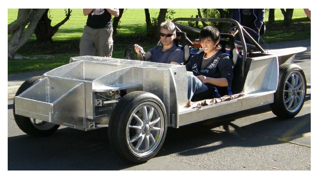
Figure 4: UltraCommuter chassis

For all vehicles the rolling resistance (RR) is dependent on tyre type, speed, pressure, road surface and condition and is usually between 0.01 and 0.02 (Bosch, 2004). The RR of a typical ICEV was therefore conservatively assumed to be 0.014. The UC however was fitted with low rolling resistance tyres with an RR of approximately 0.008.