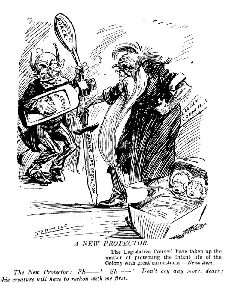
Figure 5: 'A New Protector', New Zealand Free Lance, 14 September 1907, p. 12.

The dangers of opium based soothers in New Zealand were acknowledged in debates leading up to the amended Infant Life Protection Act 1907. In this portrayal it is the chemists and druggists (depicted here as a devilish imp) who are identified as the bogeymen needing to be kept at bay by the venerable sword of the legislative council. Mothers and other female caregivers are entirely absent from the picture.