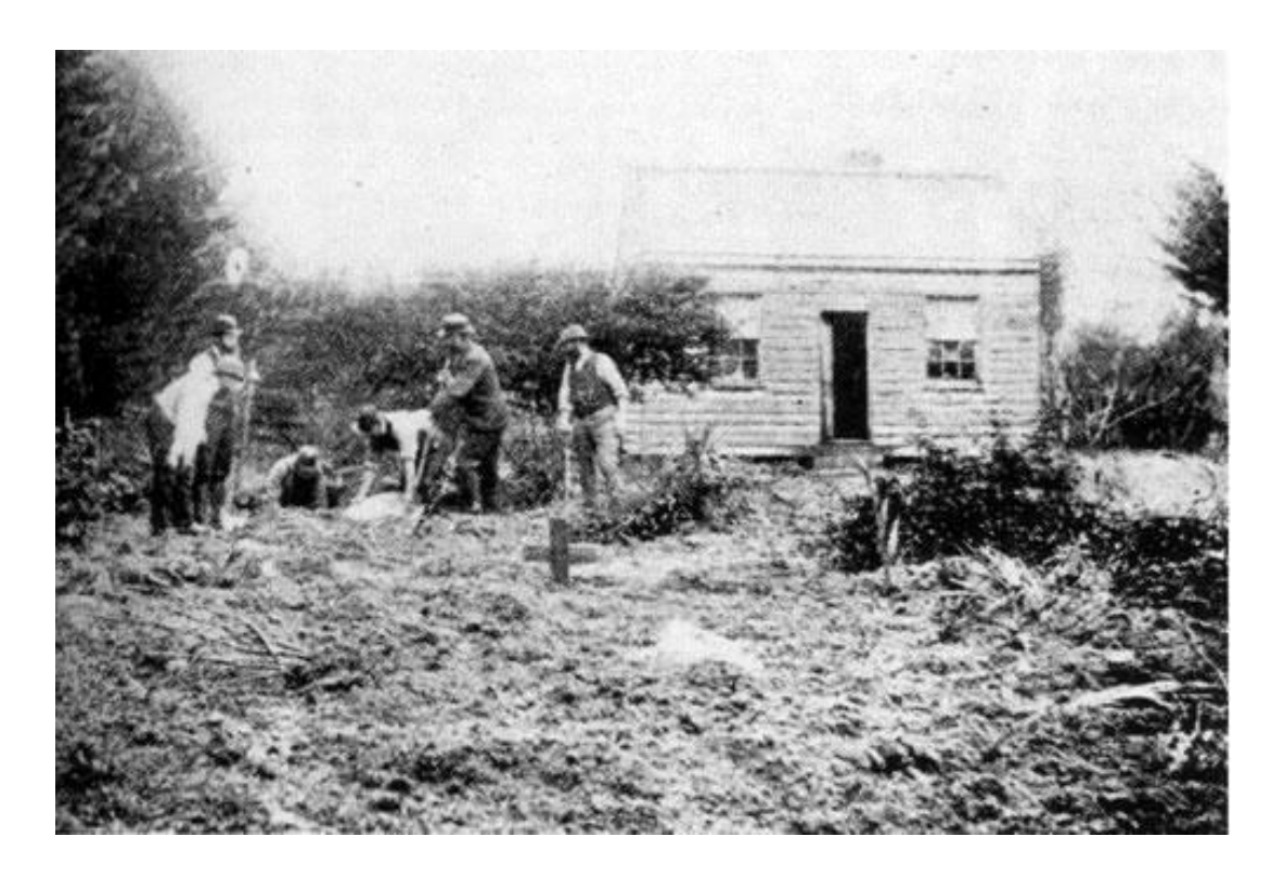
Figure 16 : Crime scene excavations at 'The Larches', home of Minnie and Charles Dean. The cross in the foreground indicates the position of the two newly buried infants.<sup>145</sup>

the condition of the house without seeing it. It is in truth a wretched hovel, and the former inmates have apparently had little or no regard for cleanliness. The house is an unpainted weatherboard structure, measuring 18ft 10in by 11ft 3in and with a small lean-to at the back. The walls are unpapered and the floor uncarpeted, and in the room at the back in which most of the children slept, the ground can be seen between the rough boards of the flooring. There is very little furniture in the house and the beds are of a very rough description, the bedding portion of which consists of old bags is also far from clean, and the whole surroundings are extremely wretched and squalid.<sup>144</sup>