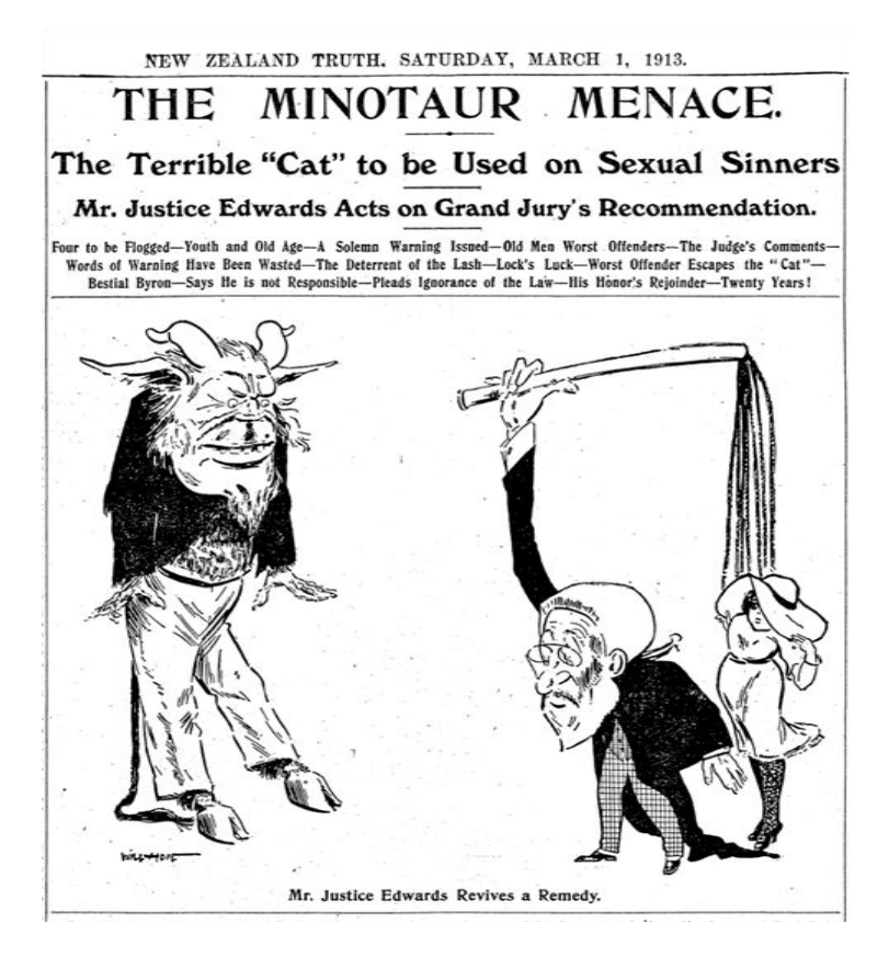
Figure 11: 'The Minotaur Menace', NZ Truth, 1913

time, under the terms of the Offences against the Person Act 1867 and the Criminal Code Act 1893.<sup>95</sup>