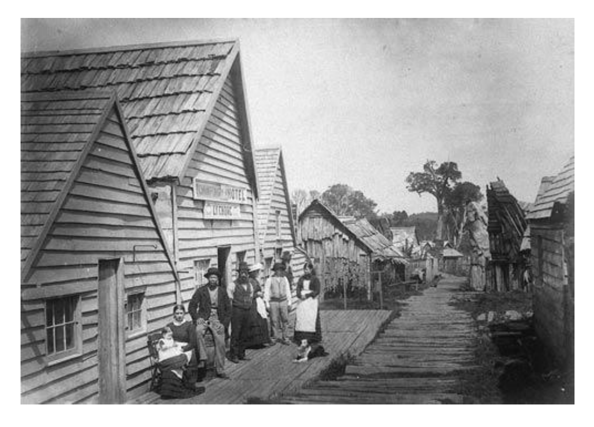
Figure 14: Round Hill or 'Canton', c. late 1880s.<sup>128</sup>

What revolt against men's cruelty and caprice has brought them to such a pass – has led them to abandon the true instincts of womanhood, and degraded them to so low a level as the mistresses and playthings of Chinamen, with whom the most depraved of them cannot have an idea in common?<sup>127</sup>