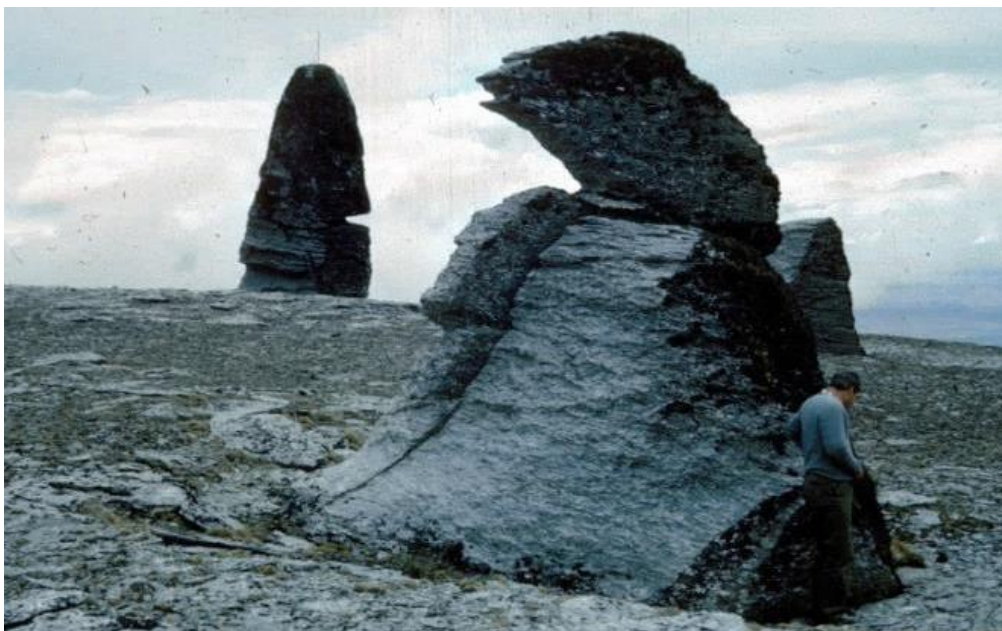
Fig. 2. John standing in a depression at the base of a schist tor on the Old Man Range (Obelisk tor is to the left).

In addition to the soil surveys, John had a keen interest in the landscapes of Central Otago and the interpretation of some of the unique features such as the upland and lowland tors (McCraw, 1965) (Fig. 2), the periglacial patterned ground of the mountain tops (McCraw, 1959) (Fig. 3), the pattern of soils from basin floor to mountain uplands (McCraw, 1962a), and the soil pattern on the alluvial fans of Central Otago (McCraw, 1968a).