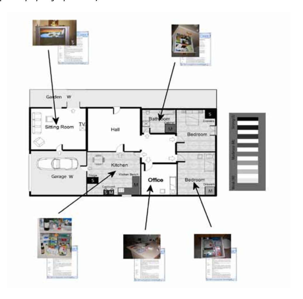
Figure 1: Composite map depicting emplacement of medications in households.

MPRU staff and students are involved in a study of medication use in everyday life. The project is a collaboration with researchers from Massey, Victoria and Otago Universities and England. This project aims to extend knowledge of relationships between people and domestic settings in the context of their medication use. We have conducted research with 20 households to date. These households contained a range of 'medicative' forms, including prescription drugs, traditional remedies, dietary supplements and enhanced foods. The location and use of these substances within domestic dwellings speaks to processes of emplacement and identity in the creation of spaces for care. Our analysis contributes to current understanding of the ways in which objects from 'outside' the home come to be woven into relationships, identities and meanings 'inside' the home. We demonstrate that, as well as being pharmacological objects, medications are complex, socially embedded objects with histories and memories that are ingrained within contemporary relationships of care and home-making practices. The project is progressing well with a number of conference papers and journal articles being produced. Two MPRU students have completed their Master's theses as part of the project, a third student will submit her thesis for examination in early 2011 and one student is doing a 2010-2011 Honours level directed study.