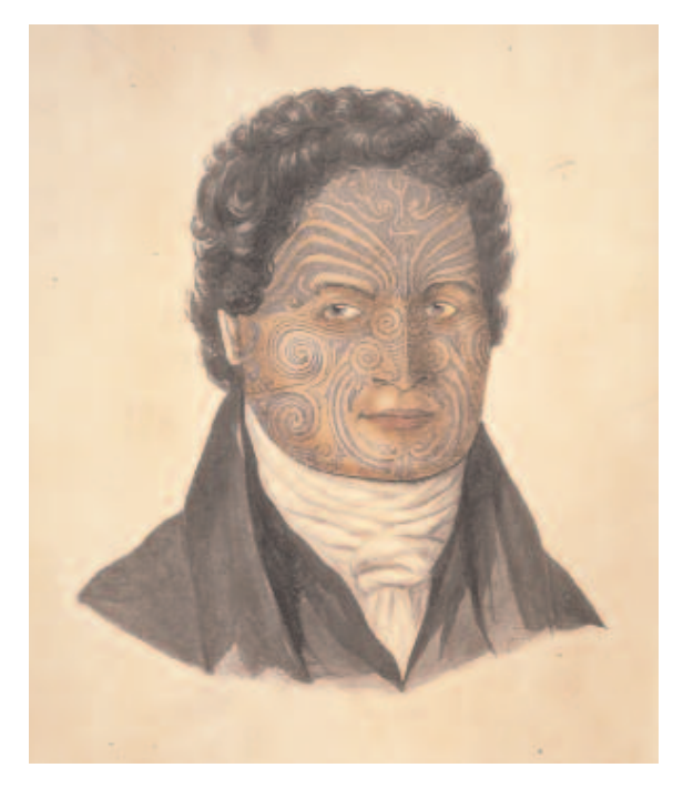
107 John Sylvester, Portrait of Te Pehi Kupe, with full tattoo on face and wearing European clothes, c. 1826, watercolour.

smooth, and the surface is fair; whilst in the former, the incision is very deep, and leaves furrows and ridges so uneven, that in some places, when long enough, it would be possible to lay a pin, which would be nearly buried in them.<sup>4</sup>