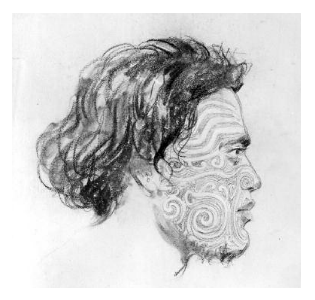
108 Charles Rodius, Chief of Otargo, New Zeeland , 1834, pencil and charcoal.

Ambivalence, a mix of horror and admiration, pervades this early writing. As the colony was established, a more condemning, sanctimonious attitude prevailed, when the moko of the Maori face, however chiefly, became a metaphor for what must be confronted and removed. Or, if at all possible, reconfigured to suit the colonizing norm.