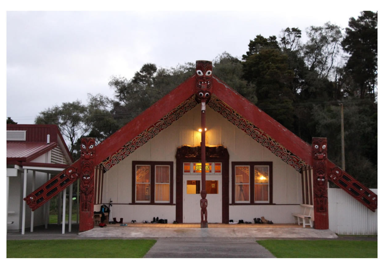
Te Tikanga marae. The wharenui at Halcombe, Manawatū.