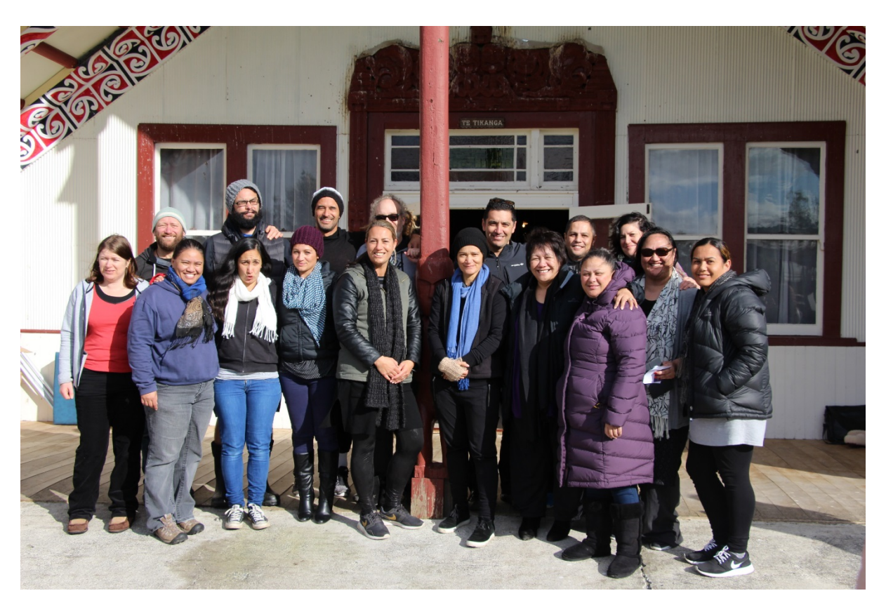
Clinical, community and educational psychologists