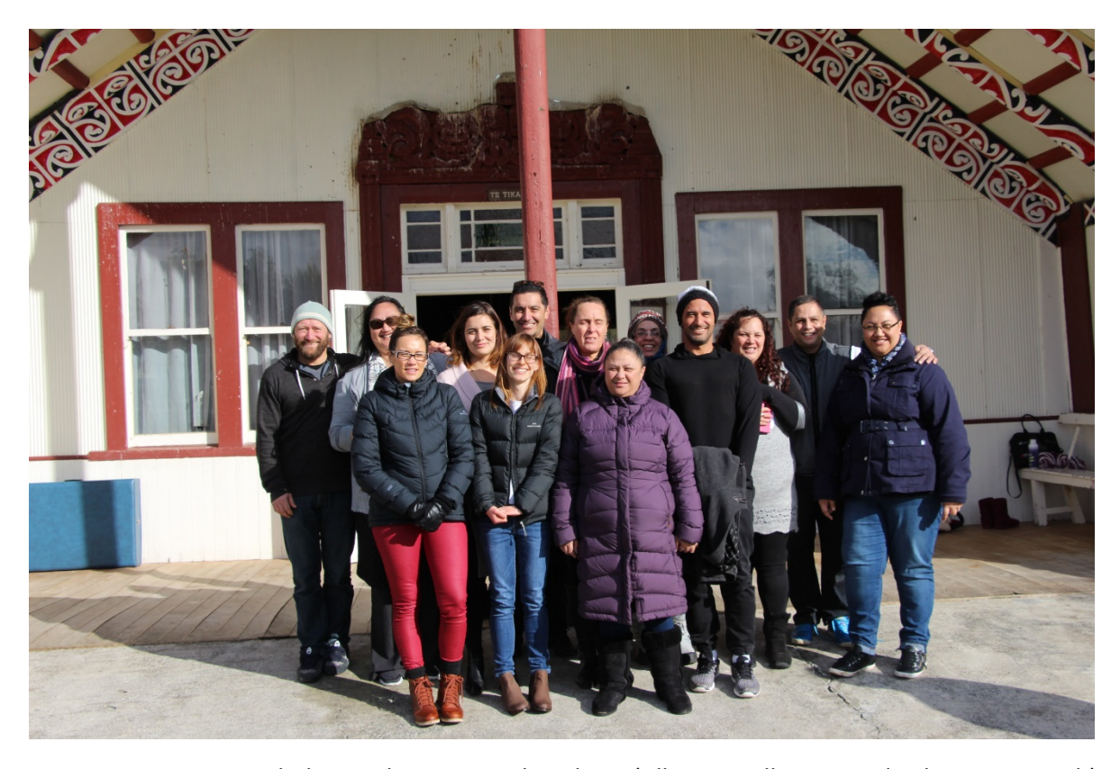
Massey University psychologists, lecturers and students (Albany, Wellington and Palmerston North).