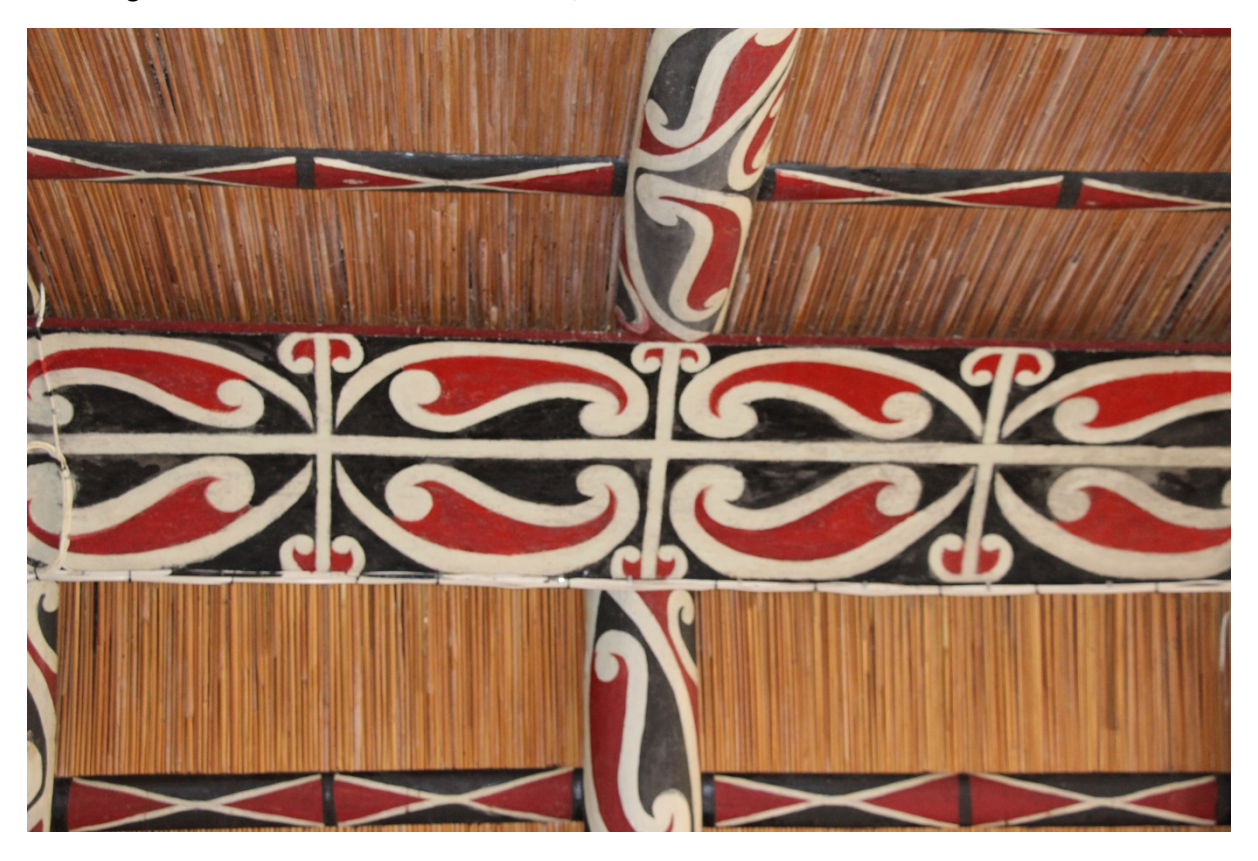
Ceiling within the wharenui. Te Tikanga house is an historic building made without nails. The history of the building was described by the marae kaumatua on the first night of the noho.