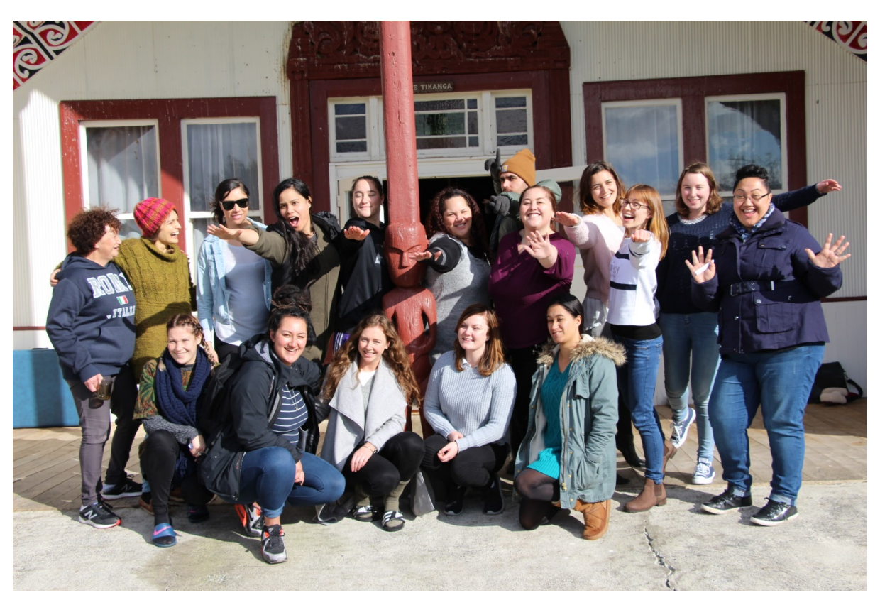
Psychology students from Massey, Auckland, Victoria, Waikato, and Dunedin.