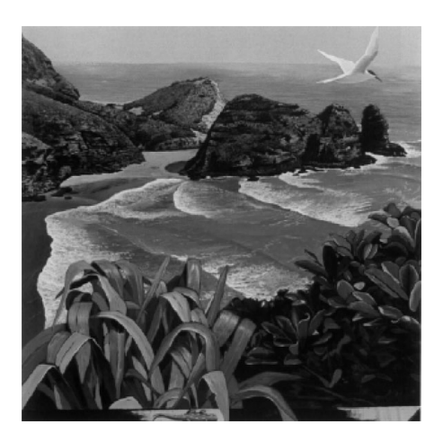
Fig. 2 Russell Jackson. South Piha. 1992

appealed to them. The following paintings were chosen: