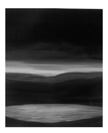
Fig. 4 Felicity West. West Coast. 2000

their ideas. In retrospect, this aim was not properly thought through. As we discovered, for good reason, the urge to compose took precedence over the plan to notate. In the final analysis, the notational symbol system proved redundant, since the students had little difficulty remembering their pieces, which they continued to refine, right up to the point of recording them.