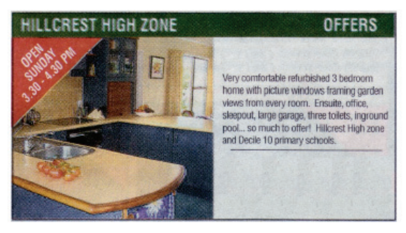
Figure 2. Advertisement highlighting SES status [address and agent deleted].

Hillcrest in Hamilton is a good example. I live in Hillcrest and after my big commutes to London I love being able to walk to work each day but it is clear that a lot of the housing stock was built in the 1950s and 1960s and is now a bit tired. There has also been a lot of infill housing. Yet prices are high ($350,000 and above), pushed up by investment in student rentals but also by Hillcrest's high decile schools. These nearly always feature in advertising, as is evident in this advert for a house out in Newell's Rd, a kind of rural-residential area on the outskirts of Hillcrest: