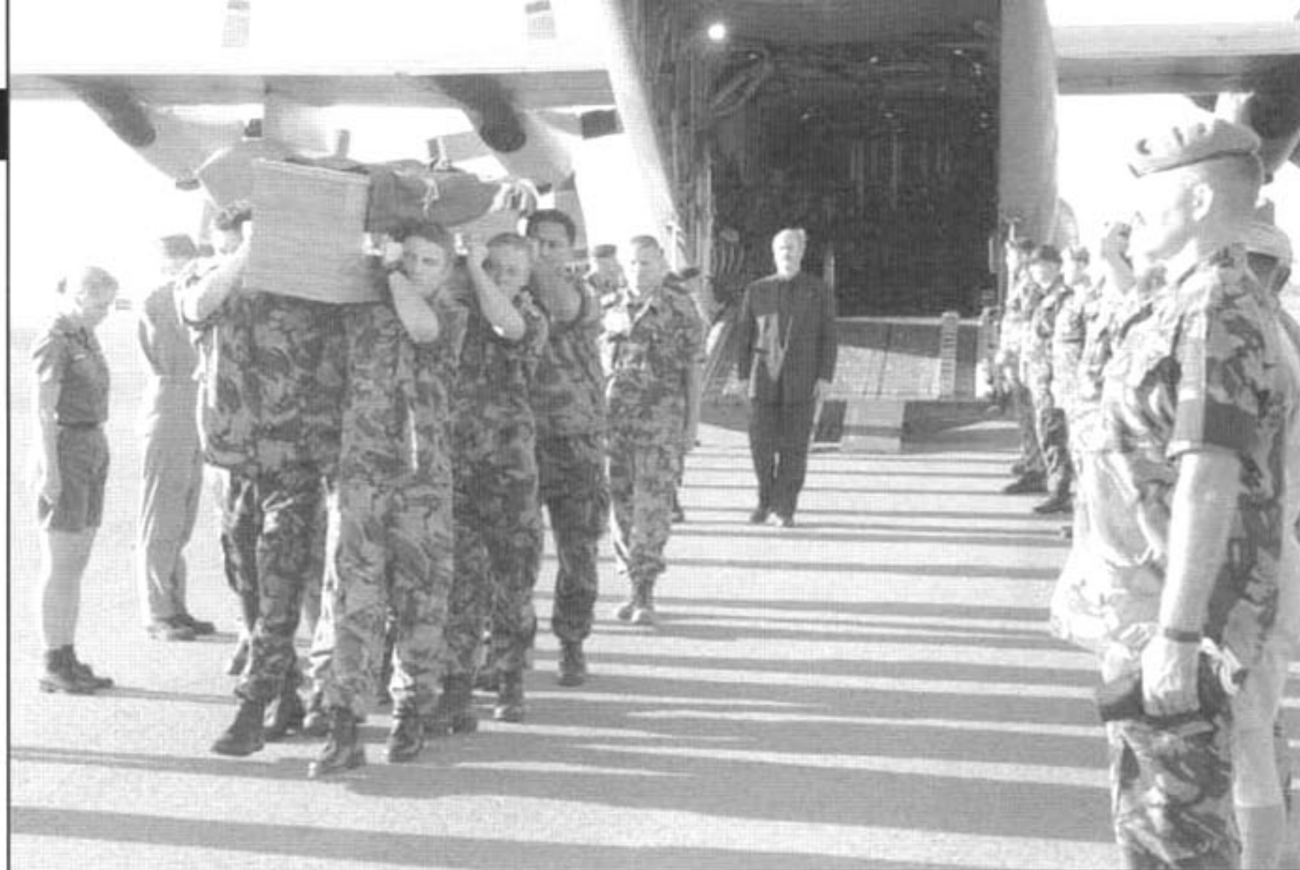
Australian Defence Force