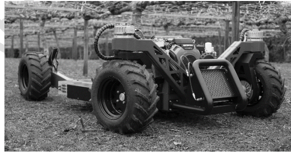
Figure 2 – The AMMP during an initial test outing

The AMMP (Autonomous Multi-purpose Mobile Platform), is a modular autonomous robotic platform developed by the CoHort (collaborative horticultural) robotics team based in New Zealand. The premise behind the AMMP's design was to create an integrated system capable of autonomously navigating horticultural orchard rows whilst harboring robotic subsystems in order to carry out laborious tasks. The platform is essentially an evolution in technology motivated by the work of founding member and director of Robotics Plus, Dr. Alistair Scarfe. Scarfe originally proposed a prototype autonomous kiwifruit harvester for potential commercial application in accordance with his PhD at Massey University [19][18].