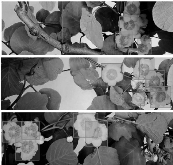
Figure 5 - Machine vision detection of kiwifruit flowers in real-world orchard environment

During the day, from flower data set with 809 flowers, the machine stereo vision was able to capture 83.0% of the flowers. On a separate 903 flower data set, the neural network image processing detected 89.6% of kiwifruit flowers from the stereo vision capture. Combining these efficiencies, 74.37% of total flowers (including occluded flowers) were detected and able to be scheduled for spraying. This rate decreased to 69.98% in the dark, at night.