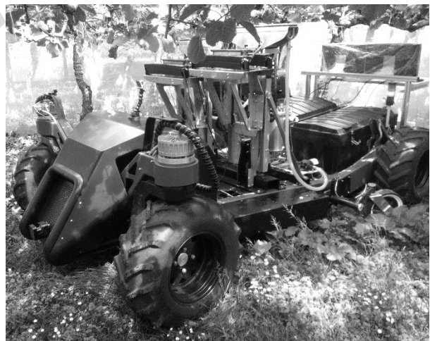
Figure 4 - Pollination system mounted on AMMP during experimental orchard trials

The system, when considering over-spraying and flower detection inefficiencies, would then spray approximately 715,000 shots of pollen solution (4.18kg of pollen) per hectare for ≈ 81% flower coverage. As it currently stands, this system uses too much pollen to be competitive with other non-robotic, mechanized methods and does not meet previously calculated commercial specification. The Cambrian hand-operated sprayer is another wet-application device commonly used for artificial kiwifruit pollination and uses 760g of pollen per hectare [31], which is over 5 times more efficient with pollen than the proposed robotic system; a per hectare cost saving of US$8660. However, as an initial attempt at developing an integrated pollination robot, this system shows great promise in many areas of its operation. In particular, the image processing showed great merit and at ~ 90% flower recognition, based on the data recorded from other robotic pollinators featured in section 1; it may be the most advanced kiwifruit-flower detection system being used today. The system still requires some development and scaling of certain elements in order to reach commercially viable specification [section 2].