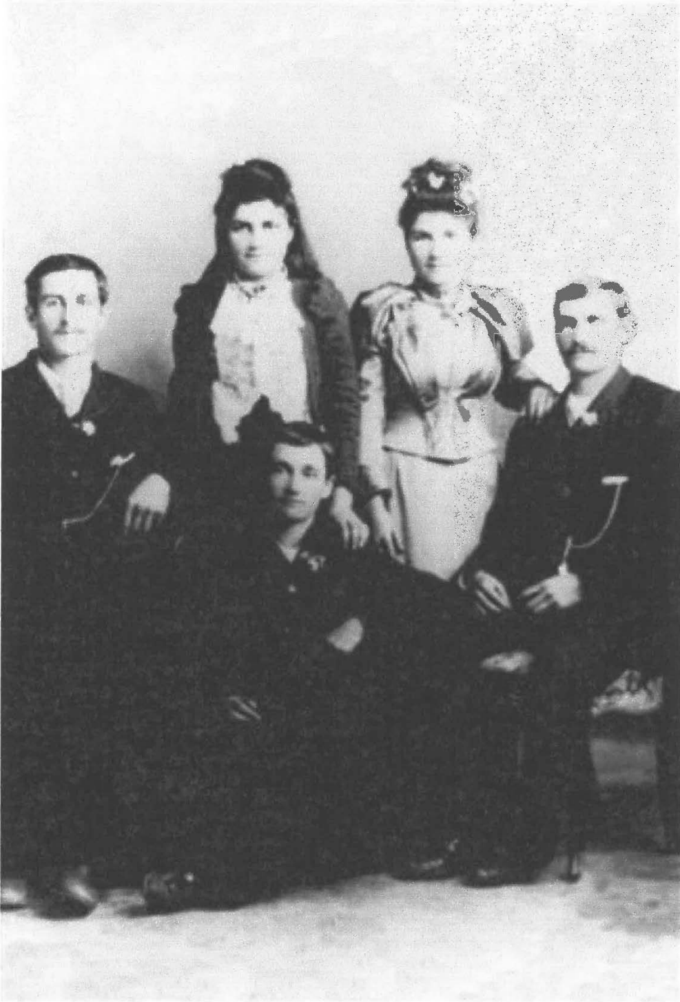
Figure 2: Photograph of Charlotte Smallman's children, n.d., Anita Manning Collection; used with permission.