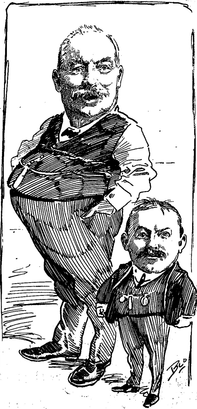
OLD "JACK" AND YOUNG "JACK." The Waitemata Duo.

Figure 2: 'Blo' [William Blomfield], 'Old "Jack" and Young "Jack." The Waitemata Duo', Observer , 22 December 1906, p. 5.