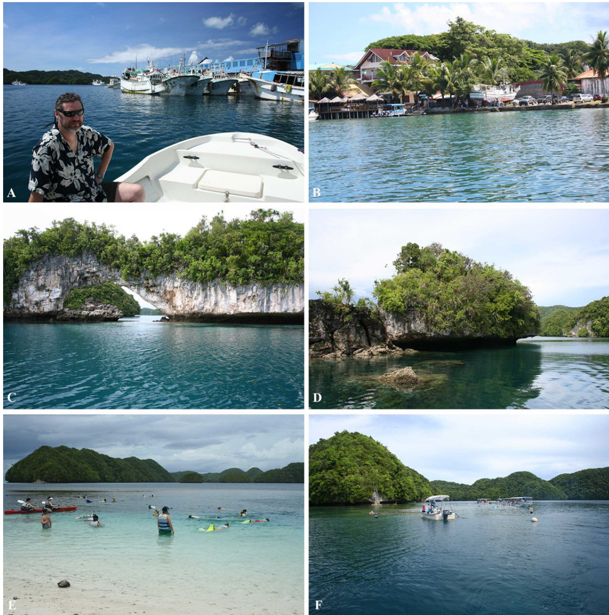
Figure 1. A selection of the survey sites in Palau: Malakal Harbour (A, B), “pristine” areas (C, D), and tourist sites (E, F).

to the survey in an ad-hoc fashion, with introduced or suspect introduced species being noted at all ad hoc sites. Samples from the hulls of three vessels were also collected in a qualitative fashion. Fouling communities were sampled at 16 sites; nine sites within Malakal Harbour and seven sites outside of the harbour, including three “pristine” sites in the Rock Islands (Figure 1). Standard 0.10 m 2 quadrats were used to sample hard substrate using the methods described in Hewitt and Martin (1996, 2001). Quadrats were sampled at three depths (–0.5m, –3m,