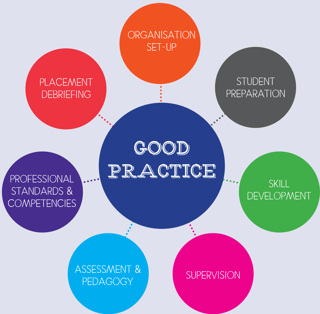
Figure 1: International Field Education Good Practice