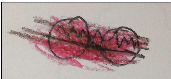
Figure 5. Manahi’s red chocolate sunglasses

then wrap it up”. This reflected the process he had observed at Candyland, with “the big machine” being a cooling tunnel into which all the students’ chocolate fish were loaded for hardening. Dana’s response was the same with the exception that she was able to name the ‘cooling machine’ that “made the fish go hard”. Manahi’s drawing, however, showed a significant broadening of his ideas and an awareness of the possibilities for colour and shape in his design. Manahi had drawn a picture of a pair of red chocolate sunglasses (see Figure 6). This differed from his initial reference to rectangular shaped chocolate and appeared to reflect the array of colours and shapes that he had seen at the Candyland shop.