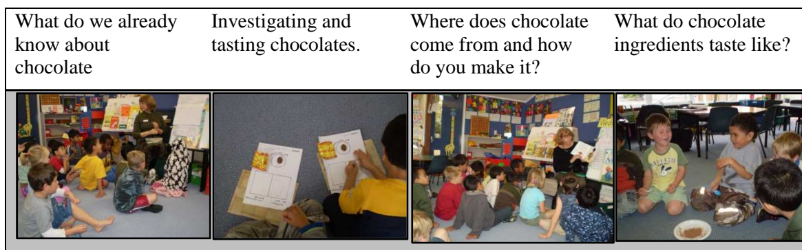
Figure 1. The pre-visit activities of the intervention model

Figure 1 shows four of the activities which were planned as part of the intervention model, and which were intended to prepare students for their visit to Candyland. A key feature was to introduce students to the issue of their technology project i.e. how could they contribute to the celebration of Mothers' Day? The teachers steered their students in the direction of creating a chocolate gift, and Candyland was identified as a place to visit to find how the students could make their chocolates.