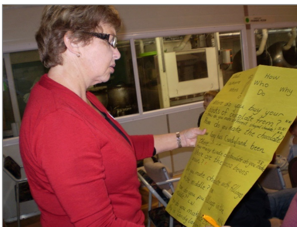
Figure 2: Questions for the presenter during an EOTC experience

This type of learning, under the umbrella of ‘informal learning’, is best described as ‘perceived choice’ learning. Students motivated by the ‘need to know’ factor ideally approach a visit with a sense of freedom to select or take note of items that appeal to them and processes