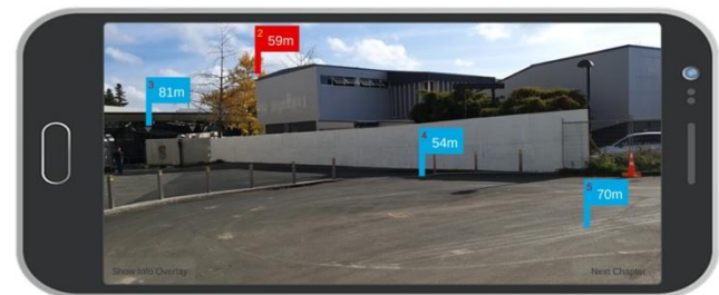
Figure 3: Scene 2 of the prototype

Using the prototype allowed us to observe that the story flags need to be shown stacked in relation to the user's view of the scene, not purely the location's terrain. Otherwise the flags may be located very high or low with respect to the user, depending on the surrounding terrain. This aspect needs to be explored further in future research.