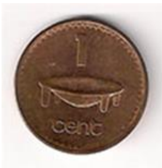
iVakatakarakara naba 3: Na ilavo ni Viti ka vakatokai me ‘dua-na-sede’. (Vakarautaka itaba: Matanitu ko Viti, 2006).