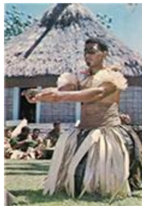
iVakatakarakara naba 5: Tutaki yaqona vakaturaga (Vakarautaka na itaba o Siers, J., 1979, ‘Fiji in Colour’).