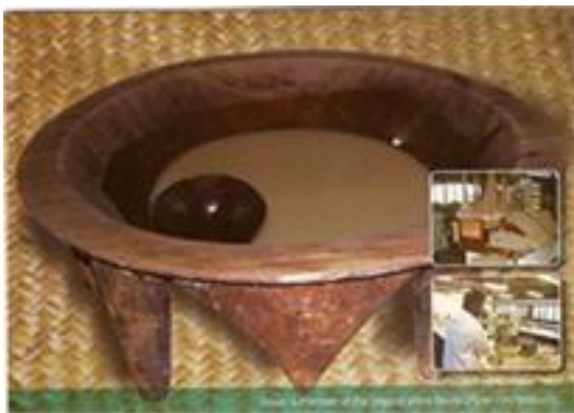
iVakatakarakara naba 7: Na itaba ena telecard ni Telecom ka vakaraitaka tiko edua na veiqaraqaravi vakavanua.