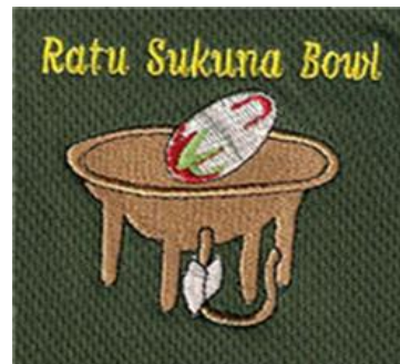
iVakatakarakara naba 4: iVakatakilakila ni Ratu Sukuna Bowl ka culai koto ena nodra siqileti nai vakalesilesi.