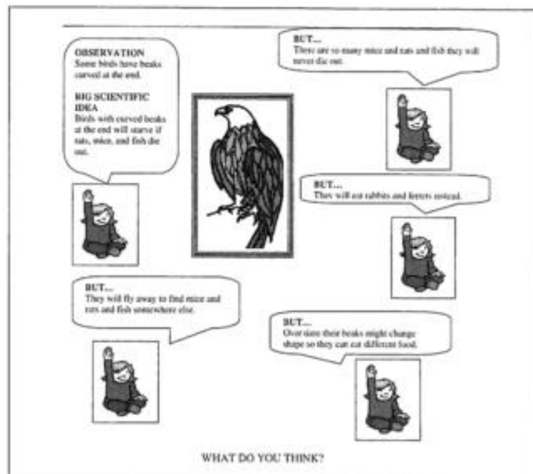
Figure 2:1 A completed Concept Cartoon tool.

This Big Scientific Idea is then transferred to a Concept Cartoon, and then your students suggest what might be written in the callouts beginning with BUT. These BUT statements form the basis of discussion around the challenge question "What Do You Think?" printed at the bottom of the Concept Cartoon.