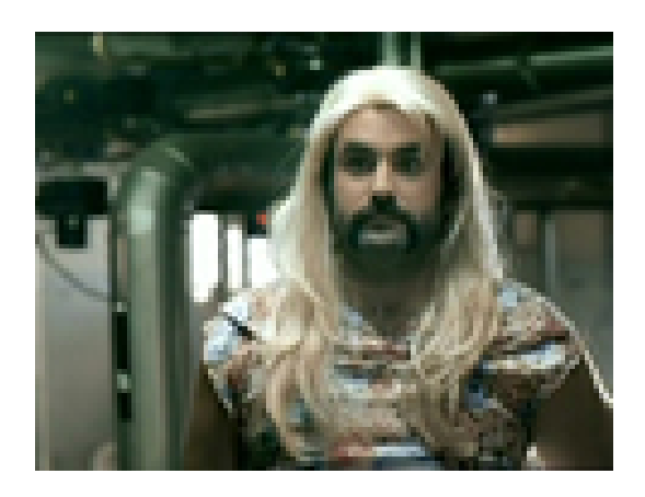
Figure 2: "Brucetta"

This is quite ironic due to the women being portrayed as having will power and control over their own temptations for beer, something that traditionally is associated with men. The advertisement therefore assures the viewers that women can be trusted to handle the beer because they do not like it. In order to get closer to the beer, two male characters, which look suspiciously like the original pioneer men, dress up as women and get a job working in the brewery. The men are caught after one of them steals a bottle of beer and they are last seen running from the brewery with a box of Tui, Figure 2 below is an image of how the men looked as they performed their feminine identity.