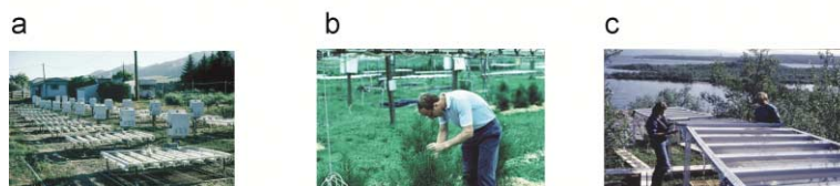
Fig. 2 Types of vegetation examined in the meta-analysis. The numbers refer to studies for individual species. Photographs of three different systems are also shown (a. wheat and wild oat experiments in Logan, Utah, USA, W. Beyschlag; b. Loblolly pine in Maryland, USA, A. Teramura; c. Subarctic heath in Sweden, from ref. 5).

were conducted in glasshouse or growth-cabinet conditions, the effects of the added UV-B radiation were greatly exaggerated. Thus, over 20 years ago investigators began to conduct such experiments outdoors using special UV lamp systems. There are now well over 100 such studies on different species of plants. Meta-analysis is a technique to use quantitative and statistical information provided in a collection of individual studies in a combined analysis to assess how well the overall research predicts common trends and results. Of the ca. 100 studies reviewed, 62 provided enough quantitative information suitable for a meta-analysis 14 for several types of managed and unmanaged ecosystems (Fig. 2).