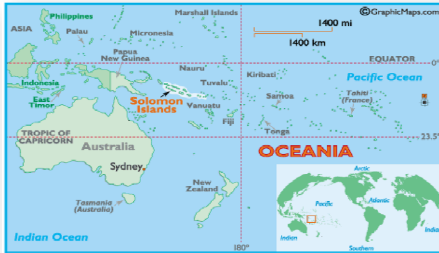
Figure 1.1: Location of Solomon Islands

The Solomon Islands consists of 922 islands, of which 347 are inhabited. Being the second largest in the Melanesian chain, the Solomon Islands archipelago covers approximately 1,632,964 square kilometres of ocean and includes a landmass of some 28,370 square kilometres (Kabutaulako, 1993). The largest of the 922 islands is Guadalcanal with 5,340 square kilometres, while the smallest include the artificial islands in the Lau lagoon of less than one hectare. There are six main islands: Choiseul, Guadalcanal, Malaita, Makira (San Christobal), New Georgia and Santa Isabel.