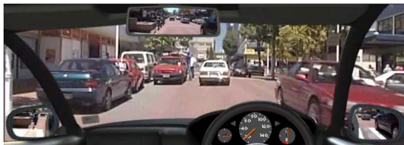
Figure 2: Example screenshot from a CD-DRIVES trial.

To bring all the video footage together required many hours in post production and a core set of four key applications. Final Cut Pro was the choice for the Non-Linear Edit software and provided not only an efficient platform for editing but also provided crucial colour correction tools used to match the colour of the four sets of footage where necessary. Compositing all four cameras and the car interior as well as the animated dash was carried out in Adobe After Effects with its powerful feature set. Perhaps most important to the final quality of the video was the use of Magic Bullet and its simple but powerful video de-interlace tool. Finally the powerful pre-processing and useful batch functionality of Discreet Cleaner 6 provided the final compression for the videos. Figure 2 shows an example screenshot of the final outcome.