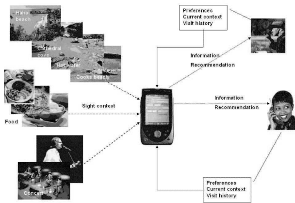
Figure 1: Data that might be used to shape the recommendations given to a user

been on previous travels and that they enjoyed. They may also be interested in new places to discover, e.g., to satisfy an interest which has not been addressed so far.