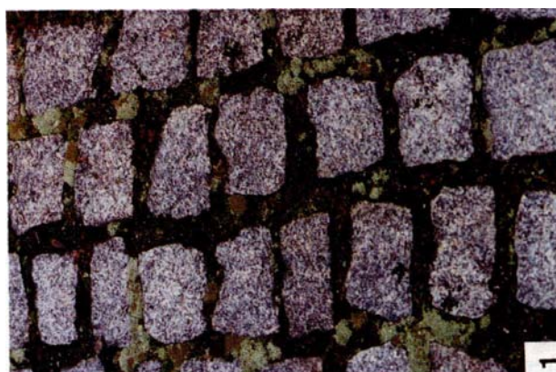
Figs 1 and 2. ( legend opposite )