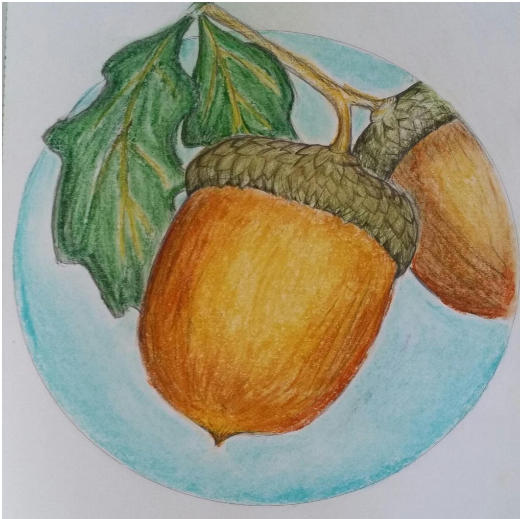
Figure 1. The Phenomenological Significance of the Organism

"Every individual exists in a continually changing world of experience of which he is the center" Proposition (I) of Rogers's theory of personality (Rogers, 2003, p. 483).