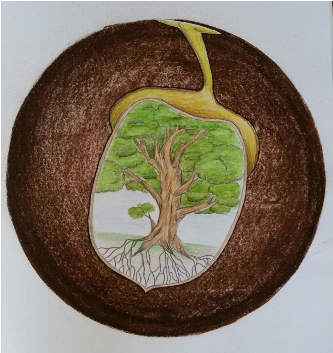
Figure 2. The Tendency to Actualise

“The organism has one basic tendency and striving – to actualize, maintain, and enhance the experiencing organism” – Proposition (IV) of Rogers’s theory of personality (Rogers, 2003, p. 487).