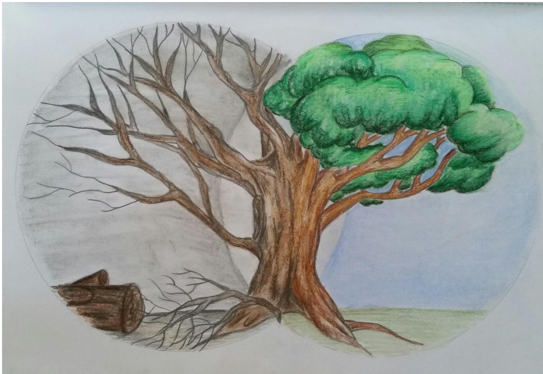
Figure 5. The Development of Self-Acceptance

Proposition (xviii) “When the individual perceives and accepts into one consistent and integrated system all his sensory and visceral experiences, then he is necessarily more understanding of others and is more accepting of others as separate individuals” (Rogers, 2003, p. 520).