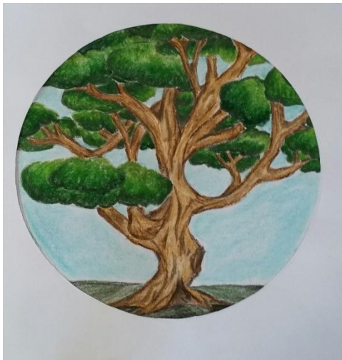
Figure 3. The Fully Functioning Self?