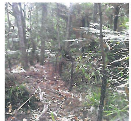
Figure 4. Mammal exclusion fence in Okataina catchment. Mammals are excluded from the right-hand side enclosure.