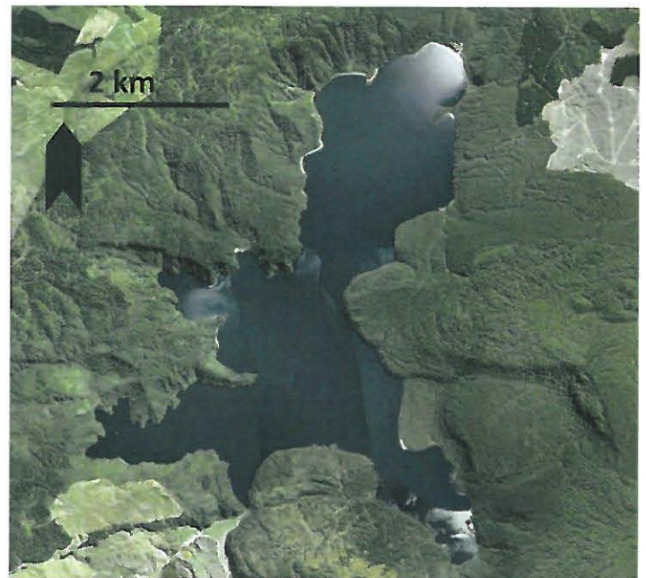
Figure 2. Lake Okataina is one of the Rotorua-Te Arawa lakes located to the east of Lake Rotorua in the Bay of Plenty region. The catchment has approximately 89% native vegetation. Image: Google Earth

Lake Okataina (Rotorua-Te Arawa lakes) is a deep (65 m), oligotrophic lake of area 10.8 km 2 , with a catchment area of 63 km 2 . The current state of Lake Okataina may be considered close to its reference condition as at least 89% of its catchment has been in indigenous forest for over 800 years, apart from periods following major volcanic eruptions (e.g., Tarawera, 1886). However, like many other lakes its catchment is dynamic and may be affected by introduced mammalian grazers such as deer, possum and wallaby and changes in climatic conditions. In order to forecast how Lake Okataina may be affected by these changes, a study of the paleolimnological conditions was conducted using sediment cores to determine the timing and effects, if any, of past volcanic eruptions, periods of Māori settlement, trout introductions and lake water level fluctuations.