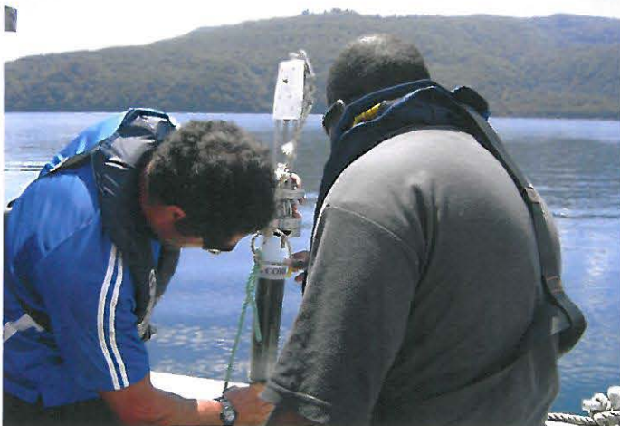
Figure 1. Retrieving a sediment core from Lake Okataina

Paleolimnology is the study of the early history of lakes based on sediment composition. Lake sediments build up in undisturbed areas of lake bottoms (e.g. in deep central basins) over long periods of time. These sediments will reflect the prevailing conditions in the catchment, climate and in-lake processes at the time of deposition. Specific 'markers' can be used to determine when a particular layer of sediment was deposited. For example, in volcanic areas lakes sediments may contain volcanic ash layers from historical eruptions that can be used to date the sediment (Figure 1). Where it is possible to take long sediment cores in relatively undisturbed areas the historical record of the lake may stretch back far enough to give insights into historical climatic conditions and pre-human-settlement state of the lake. This pre-human condition is sometimes referred to as a "reference state". Defining the reference state is important as it provides an indication of the extent to which the current state differs from it. This difference provides a useful reference point for setting targets to improve the state of a lake (e.g., as part of the limiting-setting process envisaged under the National Objectives Framework for Freshwater Management 2011).