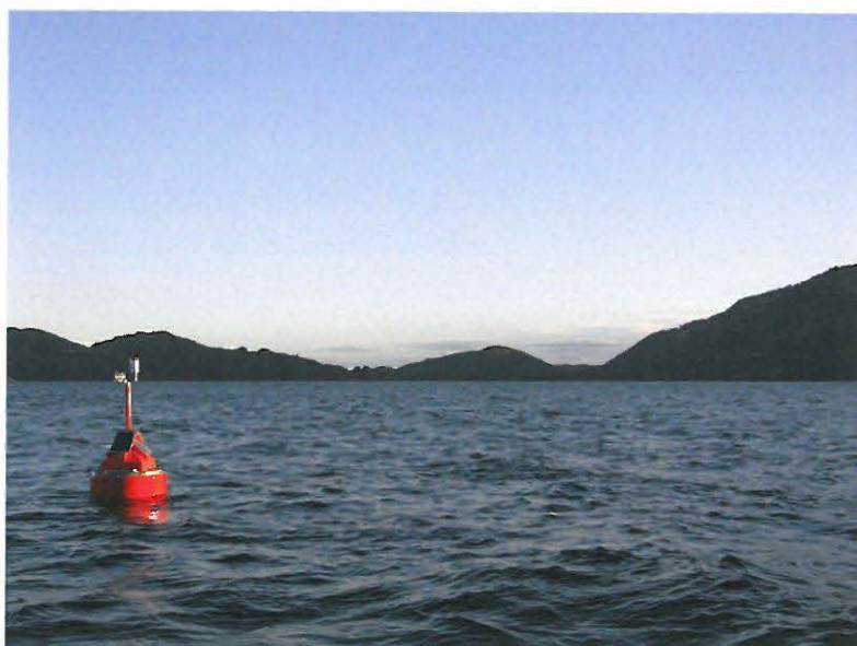
Figure 1. High-frequency monitoring buoy on Lake Waikaremoana

LakeAnalyzer uses the following input files: Bathymetry (.bth), Water Temperature (.wtr), Wind Speed (.wnd), Salinity (.sal). Outputs from LakeAnalyzer include water temperature, wind speed, thermal layer and thermocline depths, wind friction velocity, stratification parameters (Lake Number, Wedderburn Number, Schmidt Stability), the vertical seiche period, and Brunt-Väisälä buoyancy frequency. Secondary outputs for several of these indices delineate seasonal stratification from the shallower diel stratification. The inputs required vary depending on the specified output variables. For more information visit http://lakeanalyzer.gleon.org/ and download the latest manual and background information.