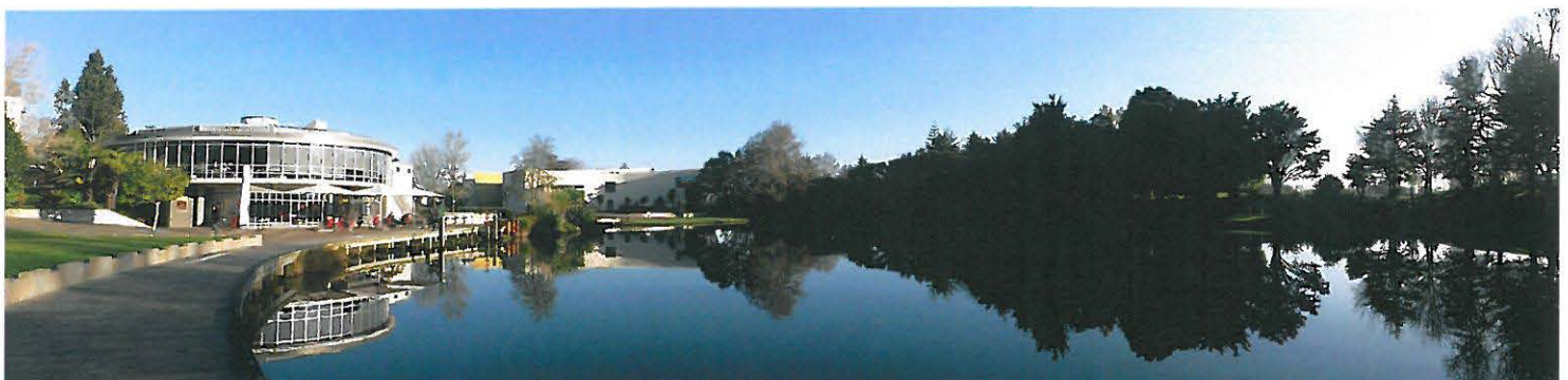
University of Waikato, Hamilton.