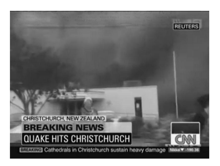
Figure 2: Screencap depicting the Ypud's viral video during news coverage. Uploaded to YouTube by Thevisitortjn2 (2011, February 22)

When first aired on national television this clip was not edited and still contained the swear word, indicating that the footage was hastily sourced by 3News, airing the clip before being able to fully review its contents.