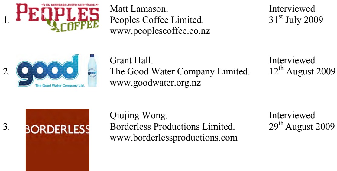
Table 3: Research participants

As a result, following a general assessment of the New Zealand business environment including online social networks such as Social Innovation Camp NZ, the following entrepreneurs were invited to participate in this research investigation (See Table 3: Research participants).