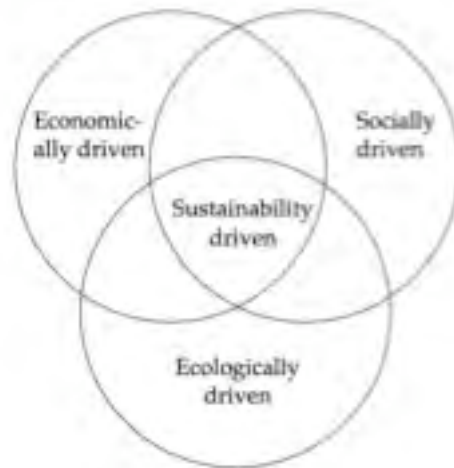
Figure 4: Schlange's (2007) model of sustainability driven entrepreneurship as a concept of intersection.

companies to move towards sustainable development, and maybe ultimately the failure of companies to achieve their core mission” (pg. 411). However, this research holds the view that the apparent conflation of terms can be attributed to a convergence of the outcomes sought by these concepts, rather than a nonintegrated approach to sustainability. For example, Schlange (2007) points out that, “the idea of ecopreneurship has strong parallels with social entrepreneurship, since environmental pollution frequently accounts for pressing social problems as well” (pg. 5). Such convergence is portrayed in Schlange’s (2007) model of sustainability driven entrepreneurship as a concept of integration.