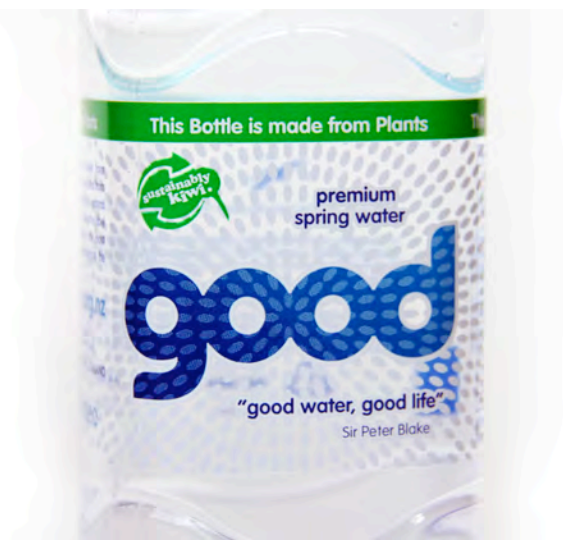
Figure 8: Good Water - The 375ml Good Water bottle made from NatureWorks PLA with the label manufactured from enviroSense bioplastic film, both manufactured from renewable resources and entirely biodegradable (The Good Water Company).

In 2009, Good Water employed three full time staff and engaged a number of part-time employees to meet the demands of various functions and events ranging from the Auckland Foodshow to the Highlife New Years Eve Experience. Good Water sold in the 375ml ‘goodie’ screw cap and 650ml ‘good’ sipper cap sizes, primarily through the on-trade channel directly to restaurants, cafés, and bars, but also at functions and events as well as indirectly through some regional off-trade accounts with retailers such as Starmart and New World. On 30 November 2009, Good Water received their first national off-trade account order from Progressive Enterprises to supply Foodtown, Countdown, and Woolworths supermarkets with Good Water products nationwide. This would provide Good Water a valuable national presence, greater public exposure and accessibility. In the fiscal year ending March 2009, the 650ml bottle made up approximately 60% of unit sales, representing 67% of total sales value, with the 375ml bottle accounting for remaining unit sales and value. Good Water marked their first profitable month of operation in November 2008, and with increasing sales in the latter half of 2008/09 closed out the financial year (March 2009) with a small net profit before tax of just over NZ$5,000 (Bowden et al, 2009).