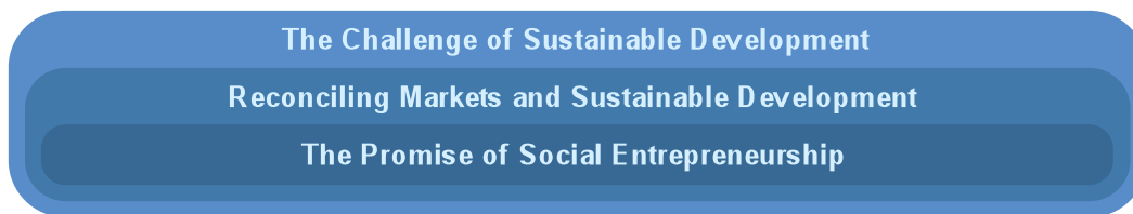
Figure 1: Literature review structure

The literature review is structured in three main sections, beginning with an examination of the challenge presented by sustainable development, followed by a discussion on the relationship between markets and sustainable development, and finally an examination of what promise social entrepreneurship holds for sustainable development (see figure 1).