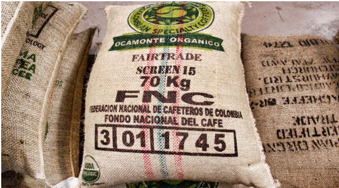
Figure 7: COSURCA Beans - A 70kg Hessian sack of certified Fairtrade organic green coffee beans from Colombia waiting to be roasted by Peoples Coffee. These beans are produced and sold by Empresa Cooperativa del Sur del Cauca (COSURCA), a co-operative composed of 15 farmer associations and coffee cooperatives from four municipalities in Cauca, a mountainous province of southwestern Colombia (Peoples Coffee).

minimum organic differential of 0.20 USD per pound (Fairtrade Labelling Organizations International, 2009a). This means that Fairtrade certified producers selling washed organic Arabica beans, such as those from the COSURCA co-operative pictured following, would currently receive a minimum of 1.55 USD per pound.