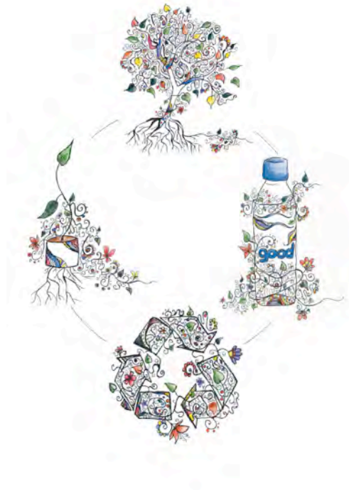
Figure 9: The perfect loop - Good Water's illustrative depiction of their product stewardship vision. Image: The Good Water Company Limited.

Braungart, McDonough and Bollinger (2007) define such upcycling as “cyclical, cradle-to-cradle ‘metabolisms’ that enable materials to maintain their status as resources and accumulate intelligence over time” (pg. 1338). Under this approach, the Good Water bottle would never acquire the status of waste and maintain a degree of value as it is cycled within a closed-loop system. Compared to the traditional cradle-to-grave approach, Braungart et al (2007) describe the resulting synergistic relationship established between ecological and economic systems inherent in the cradle-to-cradle approach as a “positive recoupling of the relationship between economy and ecology” (pg. 1338).