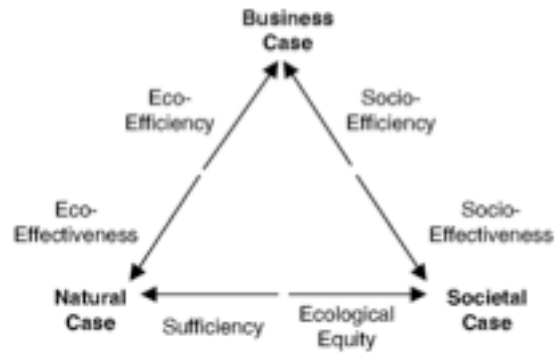
Figure 2: Dyllick and Hockerts (2002) model of corporate sustainability

Building on the Dyllick-Hockerts model, and with a focus on entrepreneurship, Young and Tilley (2006) replace the labels of business, natural and societal case with economic, environmental and social entrepreneurship with the aim of developing a model using new organisations that exhibit “strong philosophies, economic, environmental and social” (pg. 410). In addition, Young and Tilley (2006) put forward a case for a fourth conceptualisation, highlighting ‘sustainable entrepreneurship’ as a greater entity than its elements, namely economic, environmental and social entrepreneurship. Within this new conceptualisation they propose an additional set of principles by which the “higher plane of sustainable entrepreneurship” (pg. 411) may be judged or decided (see figure 3).