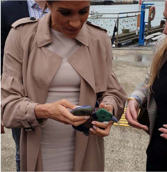
Megan Markle finds a rock in Taupo!