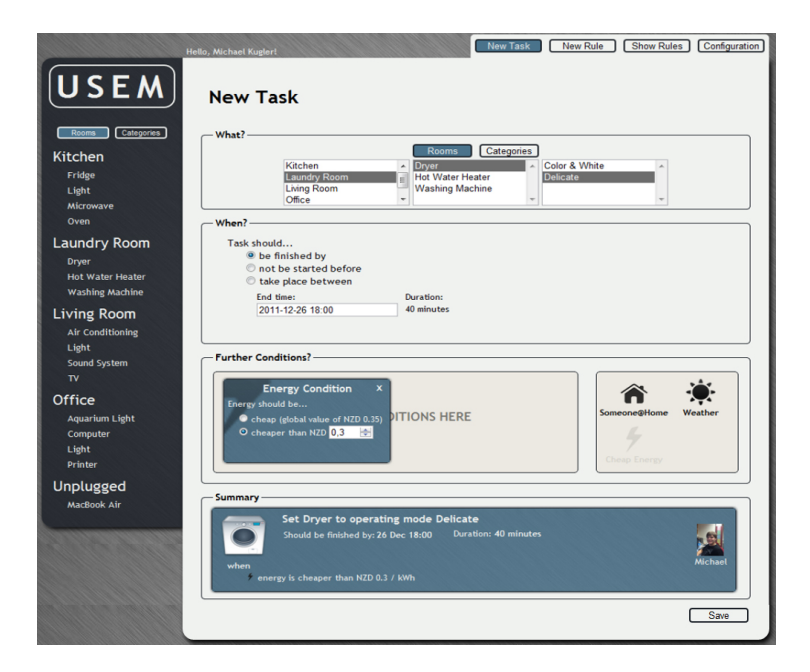
Fig. 2. The Task Editor of the web interface component of USEM.

specify the time boundaries for the task (e.g. when the tasks should be finished by, a time before which the task should not start, or a timespan in which the task should be executed). Users can also add conditions to the task in a manner similar to that of the Rule Editor. The web interface provides a summary of the task which is going to be created at the bottom.