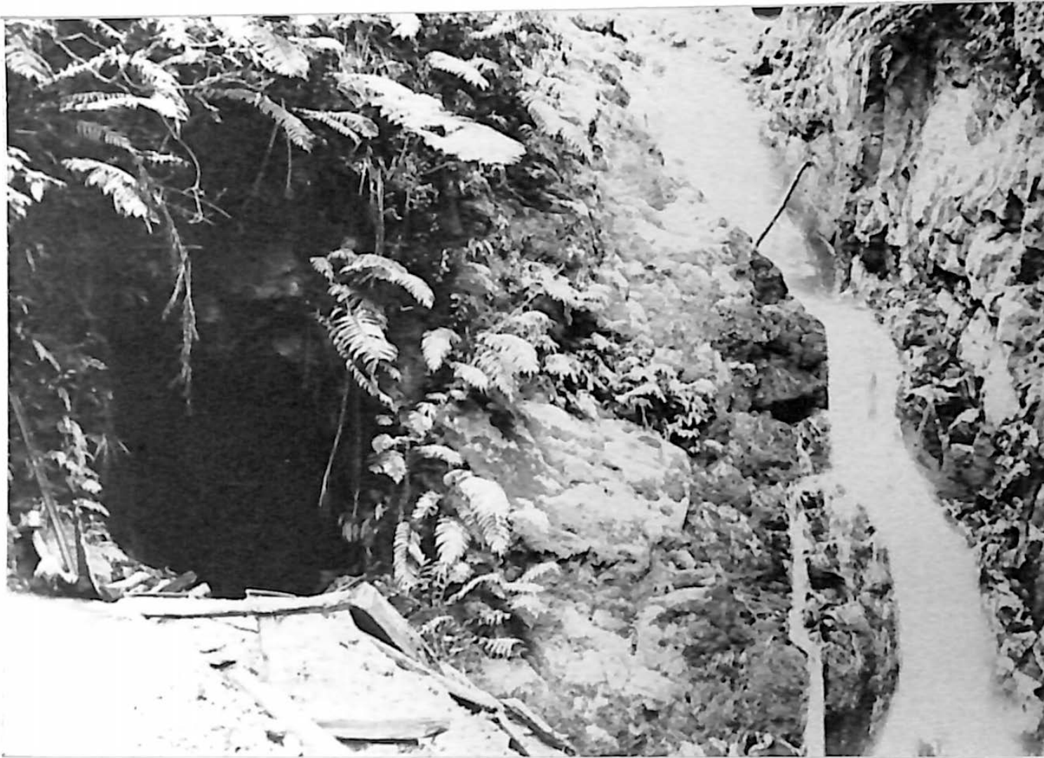
Figure 2: Portal of McLean's level, n.d. [1940s?]