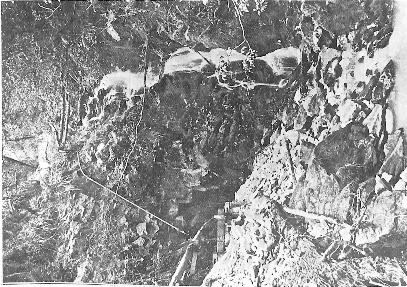
Figure 1: G. Johnson, 'Entrance to Hardy's Mine in the Ranges at Waiorongomai', Auckland Weekly News, 24 June 1909, Supplement, p. 2, C16, 703, Auckland War Memorial Museum – Tamaki Paenga Hira; used with permission.