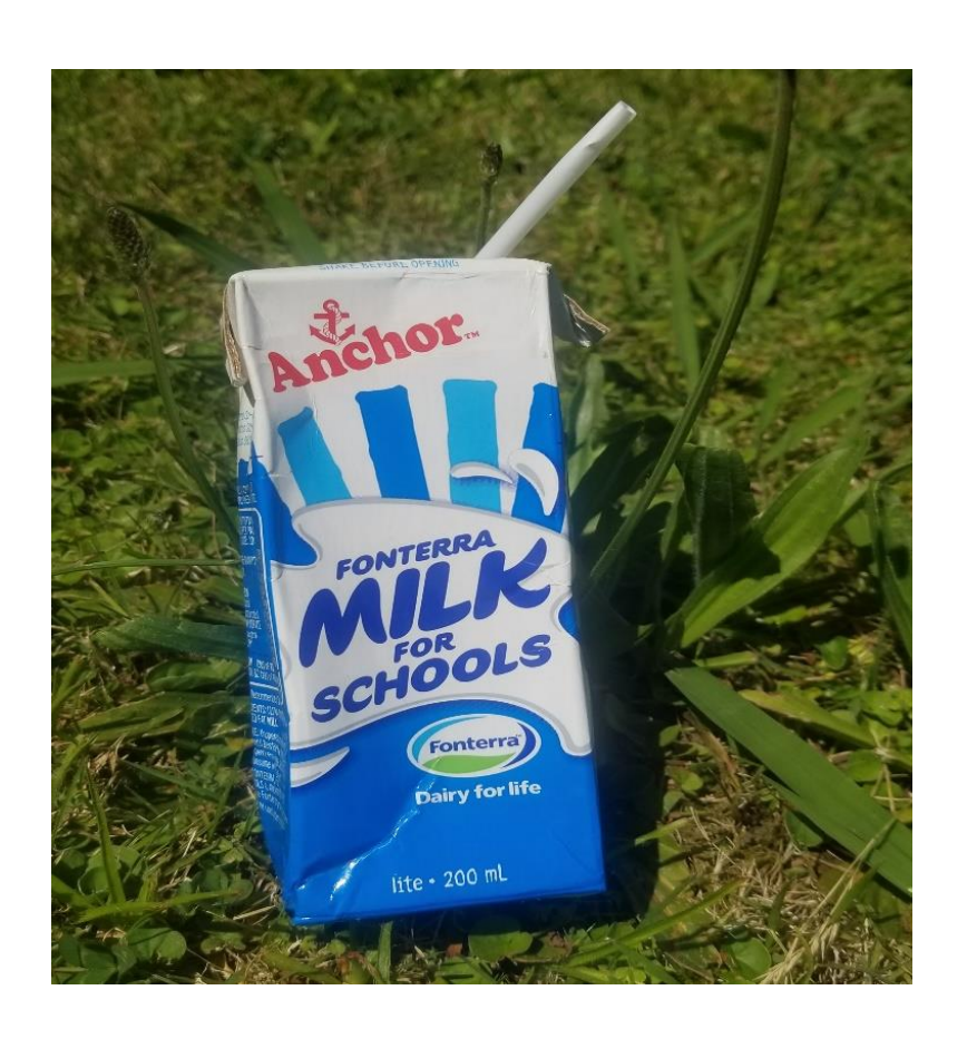
Figure 4 NZ School Milk Carton 2017

Activities relating to school milk often feature farming themes. For example, the one-year anniversary of Fonterra Milk for Schools was celebrated with farmers bringing calves and cows along to selected school playgrounds for children to pat and feed (Fonterra, 2014b). Through participating in Fonterra Milk for Schools, children are learning to drink milk and that farmers care about them. These are woven into an identity of kiwi kids, who are part of a story about the land and its bounty. Through the routines they are part of, children become 'milk drinkers' and 'kiwis'. The stories that I have explored here in relation to Fonterra Milk for Schools situate it within the landscape of corporate philanthropy in schools, but also illustrate the distinctive position of school milk in the New Zealand context.