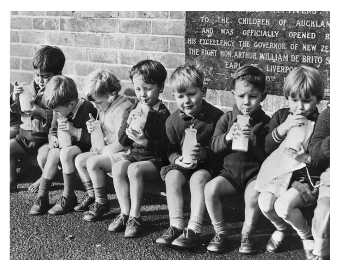
Note. Ref: MNZ-2461-1/4-F.

Milk in schools provided a tangible example of the state prioritising child nutrition, but it was situated firmly within a comprehensive set of policies designed to prevent poverty and hunger in the first place (Castles, 1985). The Labour government, elected in 1935, sought to systematically address the physical health and material living conditions of New Zealand citizens through a broad suite of policies related to housing, healthcare, benefits for mothers, and full employment (Cheyne et al., 2008, p. 31). The emphasis on families being able to support themselves through sufficient earnings from a male bread-winner, supplemented by state provision for mothers, children and the elderly, resulted in what has been deemed the 'Wage-earners' welfare state' (Wilson et al., 2013).