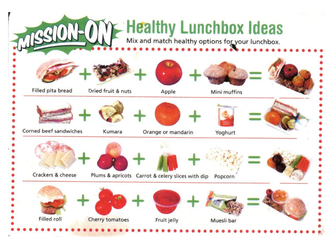
Figure 5 Picture of the lunchbox ideas fridge magnet

Note . This fridge magnet was produced by the government as part of "Mission-On", a package of health and education initiatives aimed at reducing obesity in children and young people set up in 2006.