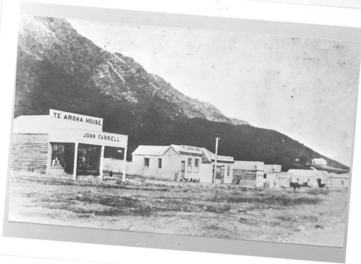
Figure 6: Portion of Whitaker Street, Te Aroha, c. 1883, Te Aroha and District Museum; used with permission.