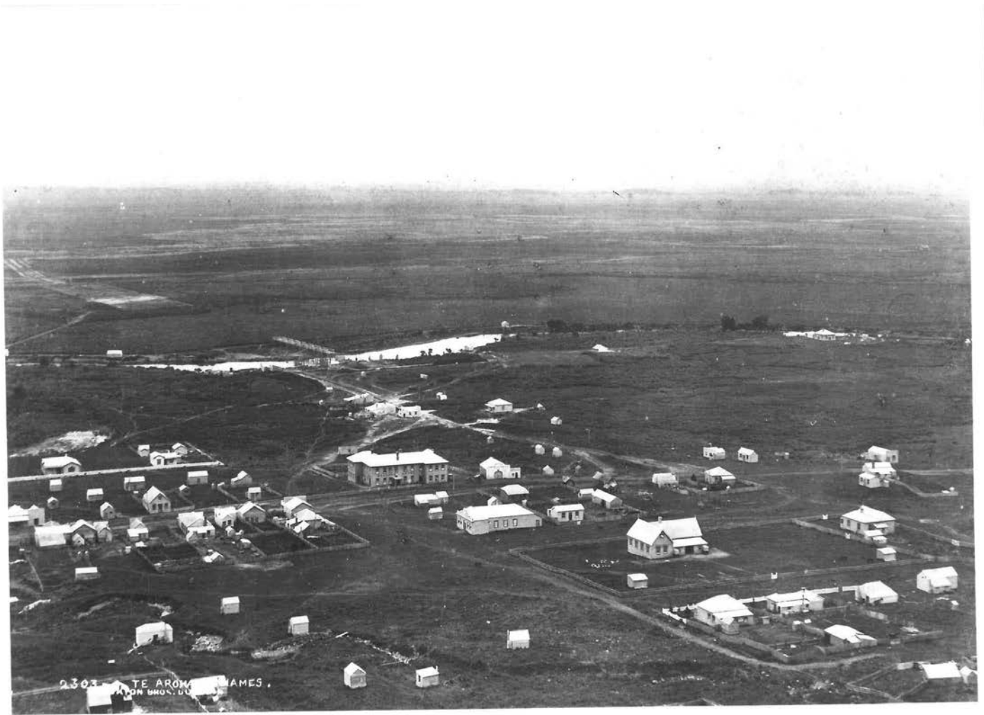
Figure 2: Burton Bros, 'Te Aroha - Thames', 1884, A10077, Sir George Grey Special Collections, Auckland Libraries; used with permission.