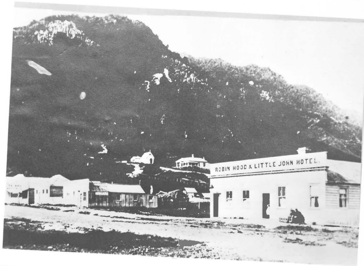
Figure 5: Robin Hood and Little John Hotel and nearby shops, c. 1883, Te Aroha and District Museum; used with permission.