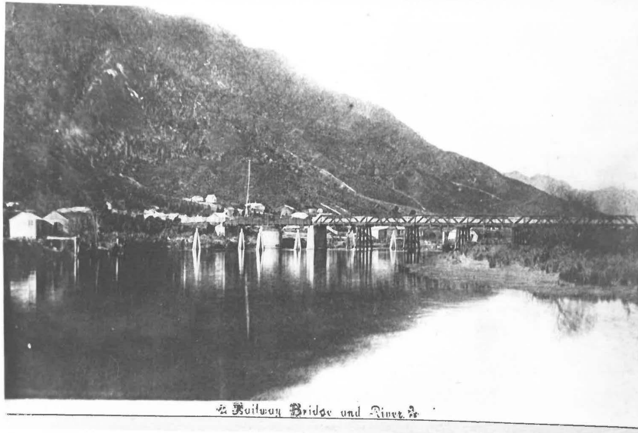
Figure 4: 'Railway Bridge and River', c. 1885, Te Aroha and District Museum; used with permission.