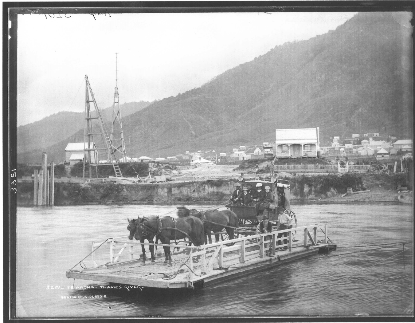
Figure 3: Burton Bros, 'Te Aroha – Thames River' [showing the coach to Hamilton being transported on the punt], 1884, C.013351, Museum of New Zealand Te Papa Tongarewa.