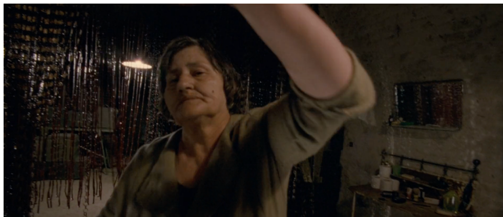
fig. 8 – The audience (as Martius) has their head shaved by a Volscian woman. (01:21:23)