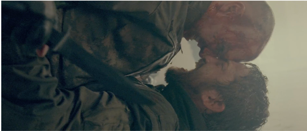
fig. 4 – Martius, on top of Aufidius, struggles for dominance. (00:24:34)