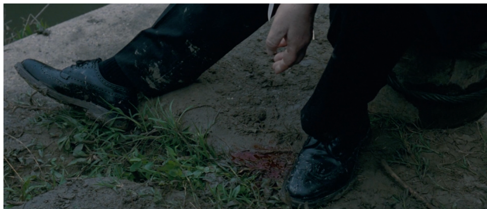
fig. 6 – Blood pools between Menenius' legs. (01:36:24)