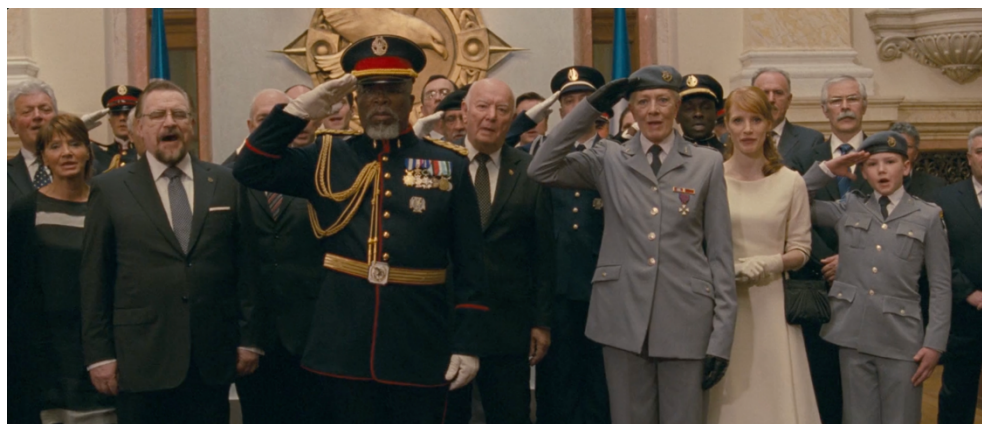
fig. 11 – Young Martius, wearing his militarised uniform, Salutes his returning father. (00:29:39)