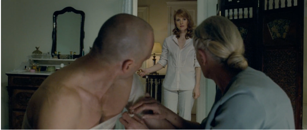
fig. 13 – Virgilia interrupts a private moment between Martius and Volumnia. (00:35:19)