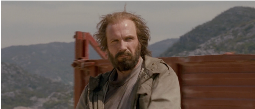
fig. 7 – Martius, following his exile, grows out his hair and wears civilian clothes. (01:13:24)