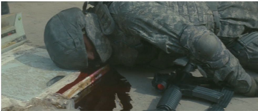
fig. 5 – The camera breaks the action to gaze at the blood of a fallen Roman soldier. (00:12:00)