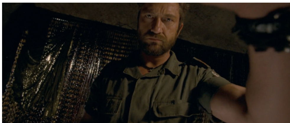
fig. 9 – The Volscian woman suddenly transforms into Aufidius. (01:21:34)