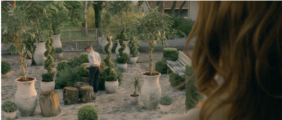
fig. 10 – Young Martius, wearing his button-up and trousers, places his gun on a tree stump while his mother watches. (00:13:07)