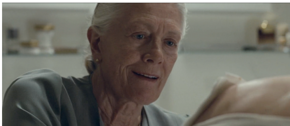
fig. 12 – Volumnia lovingly bandages Martius' body after his return from war. (00:35:04)