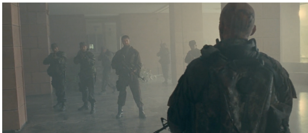
fig. 3 –Martius and Aufidius demonstrate Connell’s sizing gaze across a dusty room during the Roman-Volsci conflict in Corioles. (00:22:53)