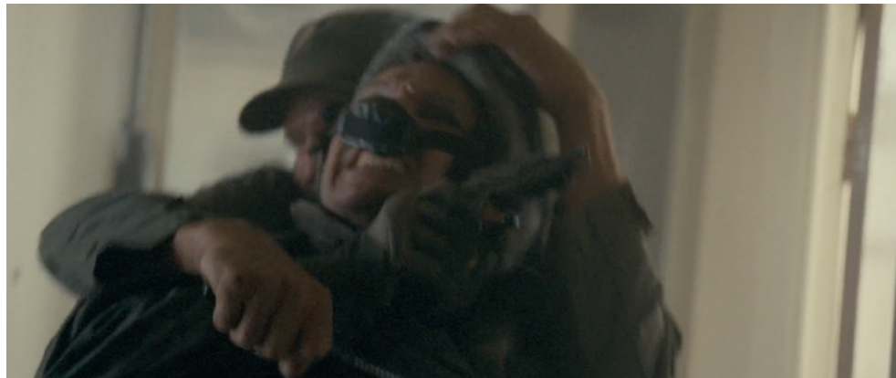
fig. 2 – A Volsci soldier attacks an unsuspecting Martius, holding him at knifepoint. (00:19:04).