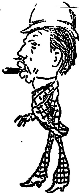
Figure 1: Extract from 'Pars About People', Observer , 15 April 1893, p. 7.