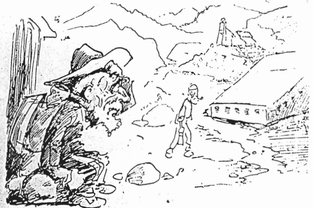
While the old prospector, who uncovered the riches, goes back to hard- ships and starvation.