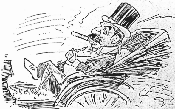
Mr Speculator earns his reward for wit and shrewdness.