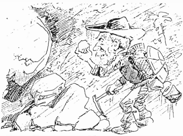
PROSPECTOR BILL : Ah ! there's a real nice, likely bit of stuff, and there's plenty of 'it' here. I guess I'll 'peg out a claim.