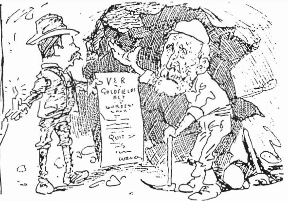
WARDEN'S OFFICER : Here, Bill, you've got to quit this ground. It's jumped for not complying with the Act. Prospector Bill, God heavens ! I let that all to Speculator. He's rich.