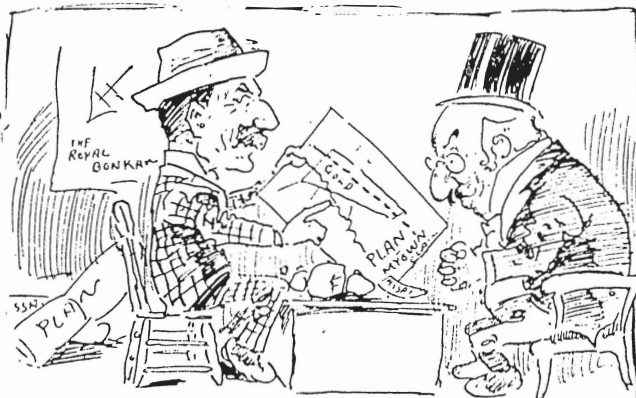
MR BOODLER : You've cut into the lower level, Speculator, and it's more than payable. Now, I'll put in a claim for forfeiture for not complying with the Mining Act. You've seen to that all right, of course.