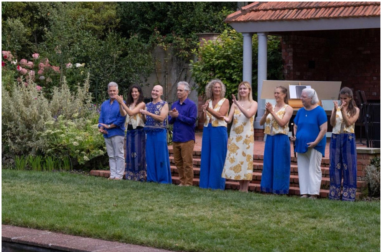
Cast of Garden of Returning Souls (minus Rachael Griffiths-Hughes)