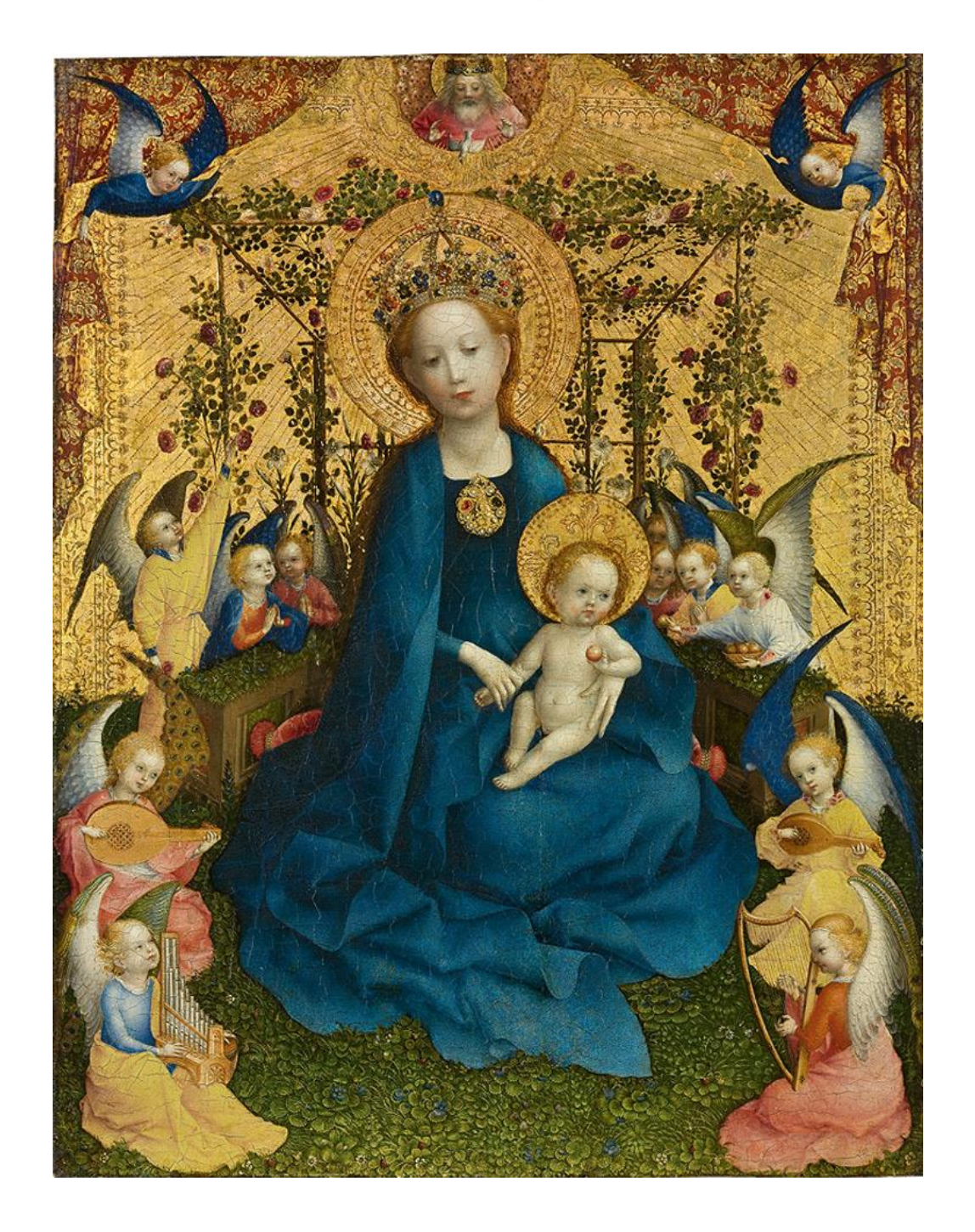
Appendix 5 : Page 1 of 1