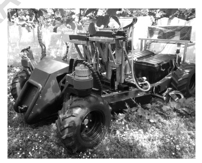
Figure 4 - Pollination system mounted on AMMP during experimental orchard trials

The system, when considering over-spraying and flower detection inefficiencies, would then spray approximately 715,000 shots of pollen solution (4.18kg of pollen) per hectare for \approx 81\% flower coverage. As it currently stands, this system uses too much pollen to be competitive with other non-robotic, mechanized methods and does not meet previously calculated commercial specification. The Cambrian hand-operated sprayer is another wet-application device commonly used for artificial kiwifruit pollination and uses 760g of pollen per hectare [31], which is over 5 times more efficient with pollen than the proposed robotic system; a per hectare cost saving of US$8660. However, as an initial attempt at developing an integrated pollination robot, this system shows great promise in many areas of its operation. In particular, the image processing showed great merit and at ~ 90% flower recognition, based on the data recorded from other robotic pollinators featured in section 1; it may be the most advanced kiwifruit-flower detection system being used today. The system still requires some development and scaling of certain elements in order to reach commercially viable specification [section 2].