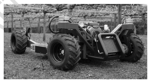
Figure 2 – The AMMP during an initial test outing

The AMMP (Autonomous Multi-purpose Mobile Platform), is a modular autonomous robotic platform developed by the CoHort (collaborative horticultural) robotics team based in New Zealand. The premise behind the AMMP's design was to create an integrated system capable of autonomously navigating horticultural orchard rows whilst harboring robotic subsystems in order to carry out laborious tasks. The platform is essentially an evolution in technology motivated by the work of founding member and director of Robotics Plus, Dr. Alistair Scarfe. Scarfe originally proposed a prototype autonomous kiwifruit harvester for potential commercial application in accordance with his PhD at Massey University [19][18].