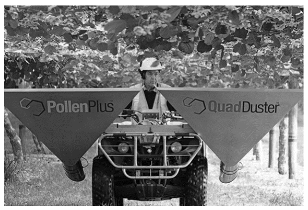
Figure 1 - PollenPlus <sup>TM</sup> QuadDuster [30]

dusting [Fig 1]. Other notable mentions in mechanized artificial pollination: