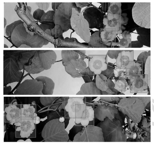
Figure 5 - Machine vision detection of kiwifruit flowers in real-world orchard environment

During the day, from flower data set with 809 flowers, the machine stereo vision was able to capture 83.0% of the flowers. On a separate 903 flower data set, the neural network image processing detected 89.6% of kiwifruit flowers from the stereo vision capture. Combining these efficiencies, 74.37% of total flowers (including occluded flowers) were detected and able to be scheduled for spraying. This rate decreased to 69.98% in the dark, at night.