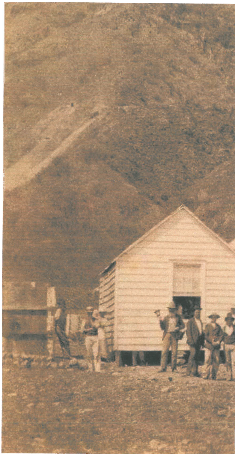
Figure 1: Portion of photograph of miners standing outside first wooden buildings at Te Aroha, n.d. [mid-1881?], showing mine workings above the settlement