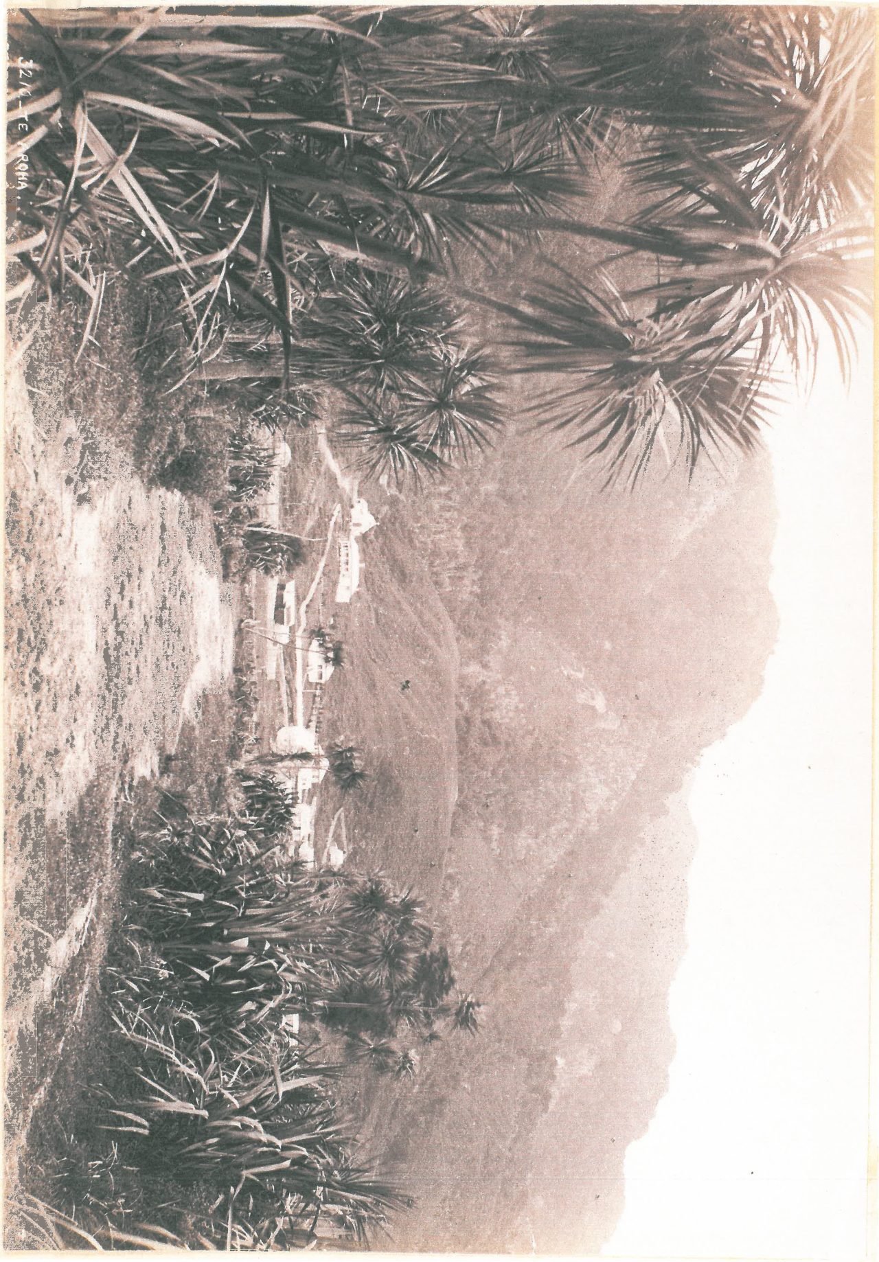
Figure 2: Burton Bros., view of Te Aroha showing cleared areas and sites of mine workings on Prospectors' Spur, 1884, Burton Brothers Collection, O.034350, Museum of New Zealand Te Papa Tongawera.