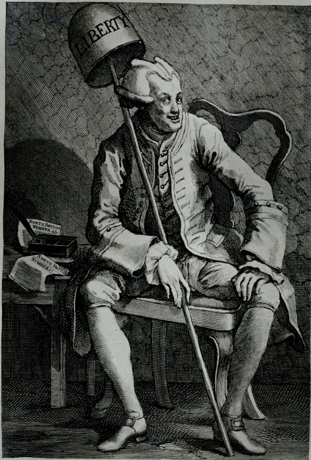
JOHN WILKES Drawn from life and etched by W. Hogarth