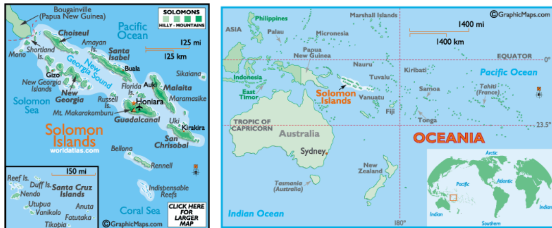
Figure 1.1. Map of Solomon Islands in relation to the Oceania region (see insert).