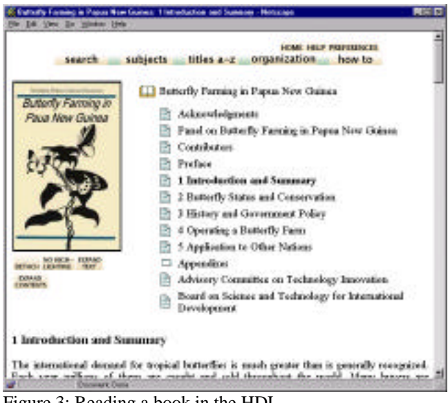
Figure 3: Reading a book in the HDL

storage. Most non-textual material is either linked to textual documents or accompanied by textual descriptions (such as photo captions) to allow full-text searching and browsing.