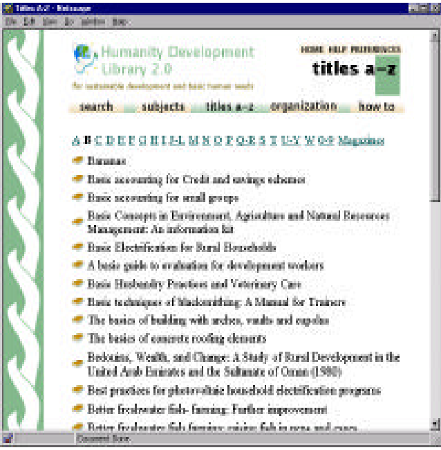
Figure 4: Browsing titles in the HDL

access publications by "how to" listing , yielding a list of hints defined by the collection's editors. We use the Dublin Core as a base and extend it in an ad hoc manner to accommodate the individual requirements of collection designers.