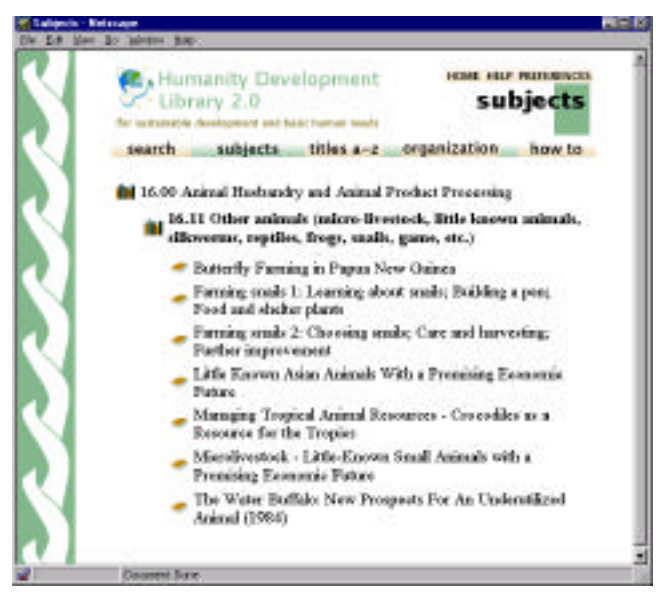
Figure 2: Browsing the HDL collection by subject

its book icon. In Figure 3 the front cover of the book is displayed as a graphic on the left, and the automatically constructed table of contents appears at the start of the document. The current focus, Introduction and Summary , is shown in bold in the table of contents with its text starting further down the page.