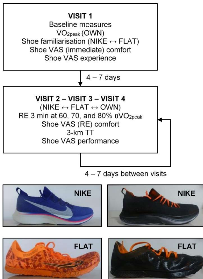
Fig. 1 Experimental study design (top) and experimental footwear (bottom) pre and post being spray-painted black. ↔, randomised; FLAT, Saucony Endorphin Racer 2 racing flats; NIKE, Nike Vaporfly; OWN, habitual shoes; RE, running economy; TT, time trial; VAS, visual analogue scale; v\dot{V}O_{2peak} , speed that elicited \dot{V}O_{2peak}

manner: NIKE, FLAT, and habitual (OWN). A minimum of four and maximum of seven days separated each session. Participants were asked to replicate their nutrition and training patterns prior to each session, which was monitored using a self-reported log. All tests were performed in a temperature-controlled laboratory, with temperatures ranging from 18 to 20 °C and relative humidity from 55 to 60%.