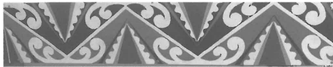
Figure 9.3: Rafter pattern, Te Ao Hurihuri, University of Waikato

The kōrero (talk) by the kaumātua helped the children, teacher and researchers to understand the origin of the kōwhaiwhai patterns and what they represented. An example of a kōwhaiwhai panel in the whareniui is given in Figure 9.3. Children learned that this pattern depicts the main awa (river) that links to the Tainui whakatauki “He piko he taniwha. He piko hé taniwha” (At every bend there is a chief). The maunga (mountain) for this iwi (tribe) is illustrated by the smaller peaks surrounded by curved white lines, symbolising the sorrow felt for those tūpuna (ancestors) buried on the mountain. The children were able to clearly distinguish the mātāoroko that was being repeated and identify a vertical line of symmetry in the centre of the unit.