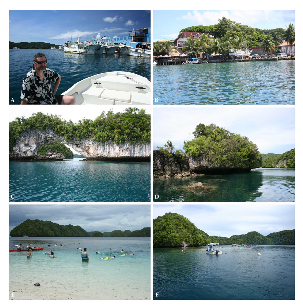
Figure 1. A selection of the survey sites in Palau: Malakal Harbour (A, B), "pristine" areas (C, D), and tourist sites (E, F).

to the survey in an ad-hoc fashion, with introduced or suspect introduced species being noted at all ad hoc sites. Samples from the hulls of three vessels were also collected in a qualitative fashion. Fouling communities were sampled at 16 sites; nine sites within Malakal Harbour and seven sites outside of the harbour, including three "pristine" sites in the Rock Islands (Figure 1). Standard 0.10 m<sup>2</sup> quadrats were used to sample hard substrate using the methods described in Hewitt and Martin (1996, 2001). Quadrats were sampled at three depths (-0.5m, -3m,