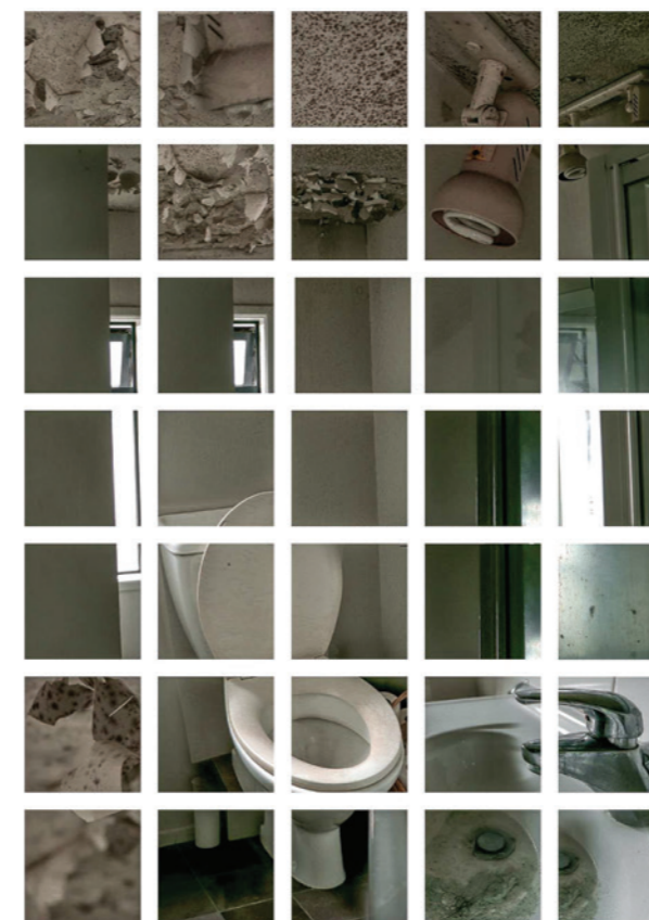
RIGHT MEGHAN MCKAY Living In Less 2024 Photography installation

Ngā Ara Auaha simply translated means 'creative pathways' and comprises a collective exhibition featuring creative works from last year undergraduate and postgraduate students across the University and working with creative practice research and outputs. The works reflect the breadth of creative pathways and practices explored and the diversity of approaches within different artistic