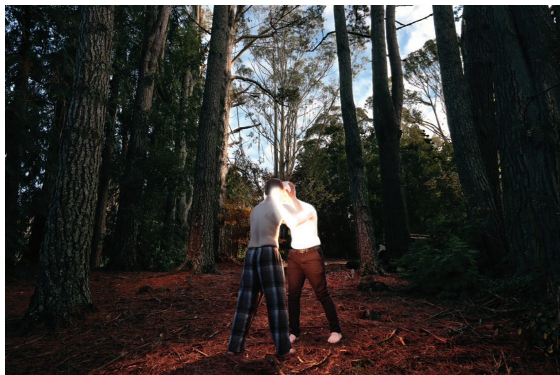
ABOVE KYLE LI The Fateful Dance of the 27 Nakshatras 2024 Photography, collage